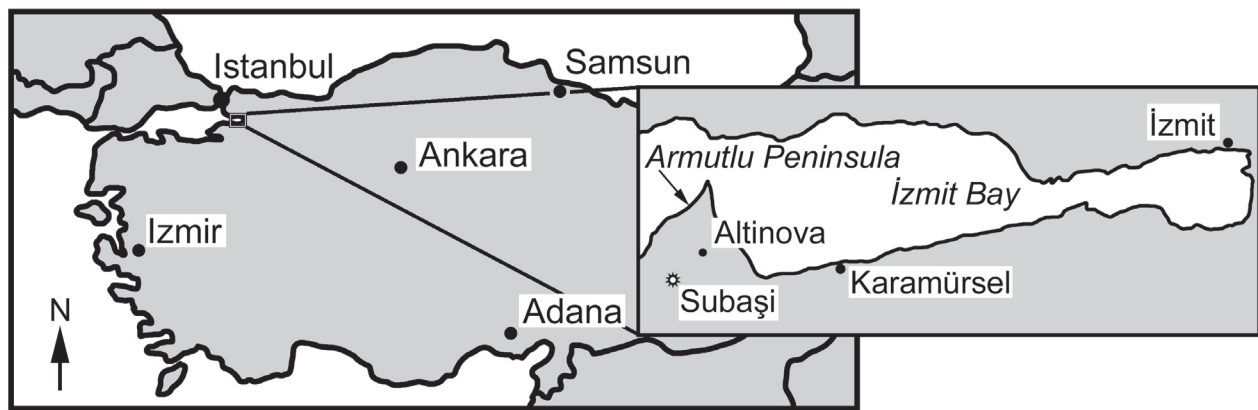
Textfigure 1: Geographic overview showing the sample locality.

Armutlu peninsula (Textfig. 1). This terrace belongs to the Marmara Formation. The sediments of the Marmara Formation are composed predominantly of fossiliferous sandstones, mudstones, and conglomerates. Tilting and faulting visible in the Marmara Formation are interpreted as results of tectonic activity, which occurred after deposition, and was induced by the North Anatolian Fault Zone (SAKINÇ & BARGU 1989; GÖRÜR et al. 1997; OKTAY et al. 2002).