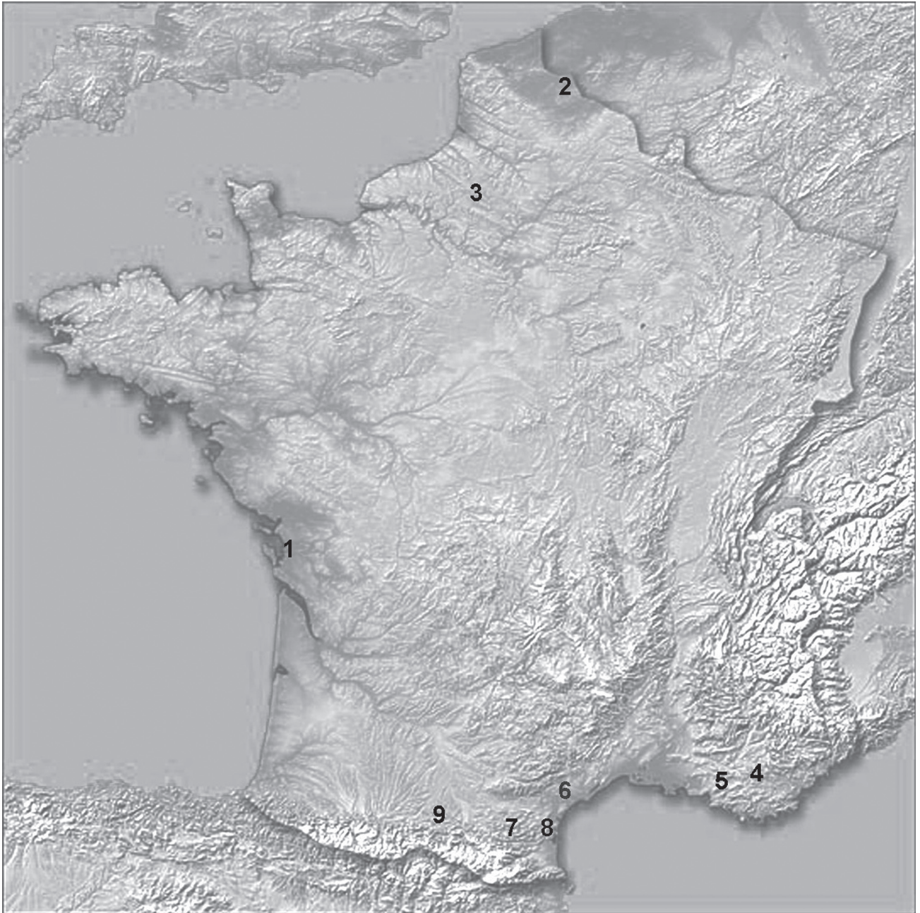
Figure 1: Map of France showing localities mentioned in text. 1: Charentes, Cenomanian: Ornithocheiridae indet. (see VULLO 2007 for details). 2: Lezennes-les-Lille (Nord), Coniacian: bone erroneously identified as pterosaurian, in fact from a turtle. 3: Notre-Dame-du-Thil (Oise), Campanian: possibly pterosaurian bones. 4: Fox-Amphoux (Var), late Campanian-early Maastrichtian: Azhdarchidae indet. 5: Pourrières (Var), late Campanian-early Maastrichtian: Pterosauria indet. 6: Cruzy (Hérault), early Maastrichtian: Azhdarchidae indet. 7: Campagne-sur-Aude (Aude), late Campanian-early Maastrichtian: Pterosauria indet. 8: Fontjoncouse (Aude), late Maastrichtian: Pterosauria indet. 9: Mérignon (Ariège), late Maastrichtian: Azhdarchidae indet.

deposits of Campanian and Maastrichtian age in southern France, from Provence to the foothills of the Pyrenees, have yielded pterosaur bones at several localities. All these finds are listed below in ascending stratigraphic order.