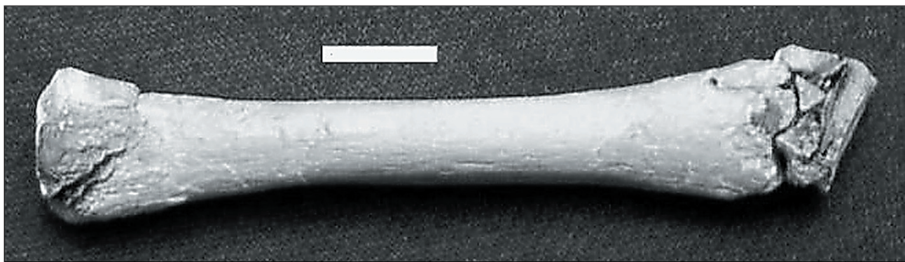
Figure 2: Bone from the Coniacian Chalk at Lezennes-lez-Lille (Nord), erroneously identified by Barrois (1875) as a pterosaur tibia, in fact in all likelihood a phalanx of a marine turtle. Muséum d'Histoire Naturelle de Lille, n° MGL 4158. Scale bar: 10 mm.