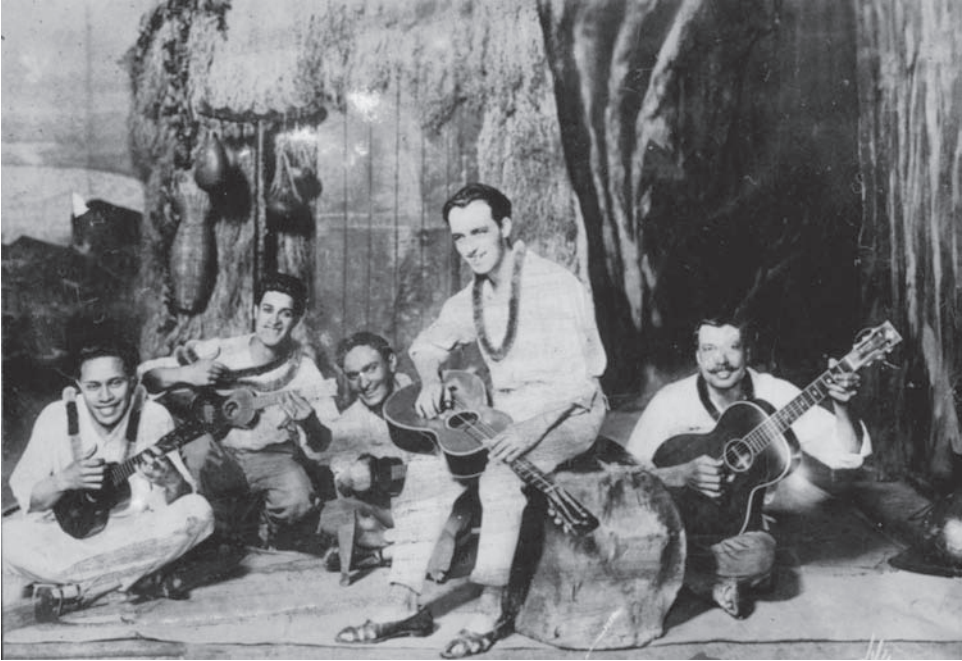
Figure 2. The Hawaiian Quintette on the set of the original New York production, 1912.

In 1916 the Edison Phonograph Monthly published an article entitled “Hawaiian Music Universally Popular,” in which the sudden success and breakthrough of Hawaiian music was traced back to the interest generated by the play and the recording.