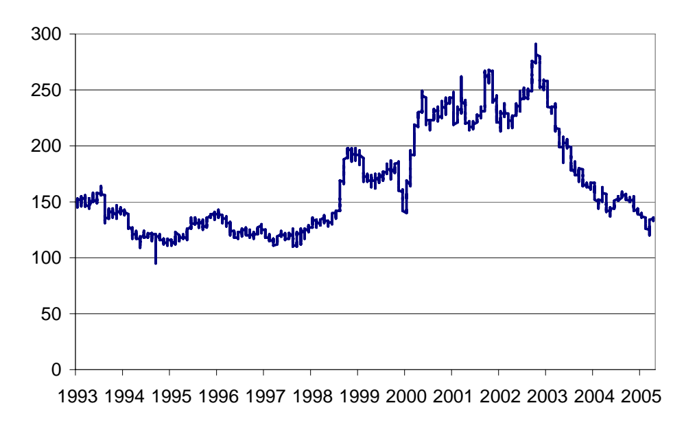
Figure 1: Yield Spread between US low grade Corporate Bonds and US Government Bonds

To estimate the effects of EMU on yield spreads, we introduce an EMU dummy that takes the value of one for the initial 11 EMU member countries starting in 1999 and for Greece starting in 2001 and zero otherwise. A significant coefficient on this dummy points to a general effect of EMU on yield spreads of all member countries. Furthermore, we interact the EMU dummy with the fiscal variables and the liquidity variable to see whether EMU has changed the effect of the fiscal variables and market liquidity on interest rates. Finally, all regressions are estimated with and without time and country fixed effects, \lambda_t and \mu_i .