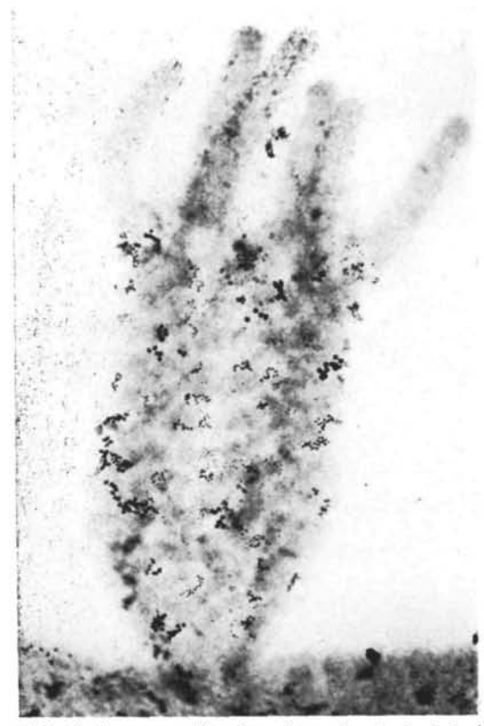
FIG. 2. Low magnification view of a bud stained with thiolacetic acid and lead nitrate. Nests of differentiating nematocytes are scattered throughout the tissue. Nematocytes in battery cells of the tentacles are not stained nor arc migrating nematocytes. \times 80 .

fication individual nests can be distinguished and the number and type of the nematocyte determined (Fig. 1). The cells in a nest are usually tightly packed together. As the nematocytes complete their