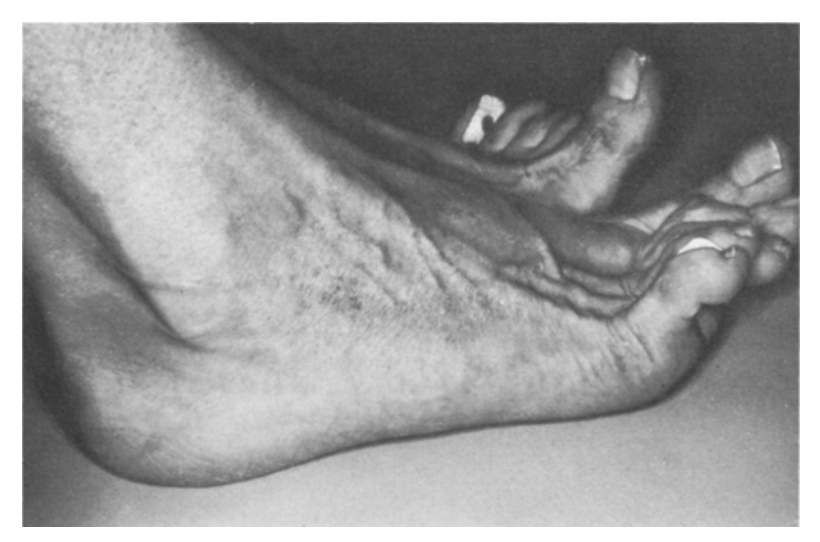
Fig. 2. Atrophy of the right extensor digitorum brevis muscle in Case 2

increased with the exception of the right deep peroneal nerve. The latency for this nerve was extremely prolonged to 16.1 msec. A right anterior tarsal tunnel syndrome and a discrete distal polyneuropathy of the lower extremities were diagnosed in this case.