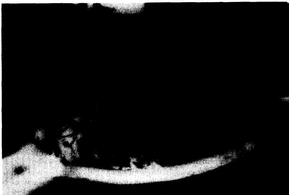
Fig. 1. Volume of foreign material ( \sim 2000 \text{ cm}^3 ) found in the bowels of a mentally handicapped 22-year-old man (case report A).

At autopsy, a button and a small amount of a yellow-brown fluid was found in the stomach. In the whole intestine foul-smelling yellow-brown content was observed, containing small branches and stones, several buttons, paper and parts of clothes. Twelve cm proximal from the ileo-caecal valve the consistency of the material increased and the colon, which was the diameter of an upper arm, was completely filled with broken glass, fragments of porcelain, buttons, balloons, cords and clips of metal. The total volume of the ingested foreign bodies was \sim 2000 \text{ cm}^3 (Fig. 1). In addition to the signs of occlusive ileus, fluid similar to that found in the stomach