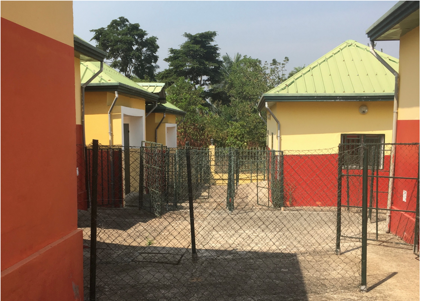
Fig 1. N'Zérékoré CTEPI, 2019.

https://doi.org/10.1371/journal.pntd.0009487.g001