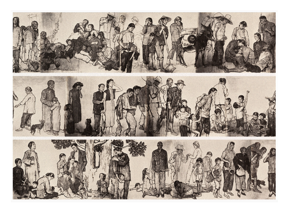
FIGURE 22.3: Photograph of 蒋兆和 《流民图》1943 中国美术馆 [Jiang Zhaohe, Liumin tu, 1943, Zhongguo meishuguan].

Jiang began to work on his project in Beijing in 1941. It resulted in an approximately 25–27 metres long and 2 metres high picture scroll. Today, only a part of the scroll remains. It has been in the National Art Museum of China (NAMOC) in Beijing since 1998. The other parts have survived in black and white photographs (fig. 22.3). Originally from Luzhou, Sichuan, Jiang himself emigrated to Shanghai in 1920. There, he first worked as a commercial artist, among others for