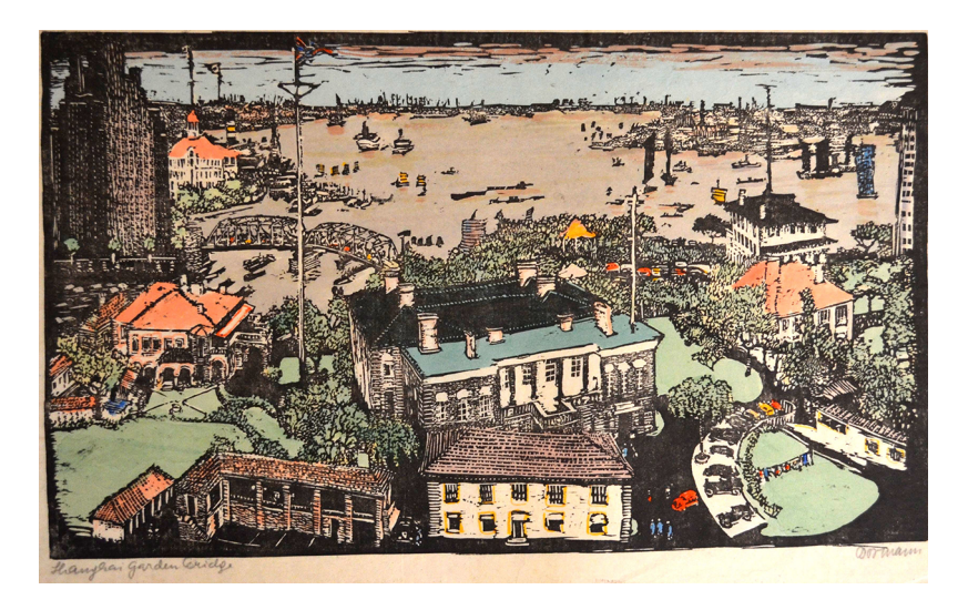
FIGUR 22.1: Emma Bormann, Shanghai Garden Bridge , woodcut, or linocut, around 1941 (© private collection).

The artist and printmaker Emma Bormann's approaches the Suzhou River estuary in her print Shanghai Garden Bridge (fig. 22.1) from an elevated vantage point south of the river.<sup>3</sup> The former British Embassy is placed in the centre of the picture. Behind the mouth of the Suzhou River, we can see the Garden Bridge (now called Waibaidu Bridge) and the Broadway Mansion. The wide riverbed of