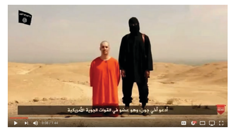
Figure 3. Screenshot from the ISIS video depicting James Foley's decapitation and used in the production, Situation with Spectators. The desert background was extracted for a triptych backdrop onstage behind the performers.

Situation with Spectators was created by the independent, Munich-based group Hauptaktion and premiered at the Kammerspiele on 20 January 2017. 14 Subtitled an "essay-performance," the piece confronts the audience with the ethical dilemma of whether or not to watch the notorious ISIS video in which US journalist James Foley is beheaded on camera.