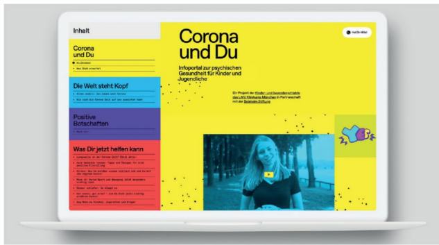
Fig. 1 Starting page of the website “Corona und Du”

of 34 participants as described above. To assess the socioeconomic status index (ses-index) according to Lampert et al. (2018) [39], sociodemographic information was obtained via a parent-report questionnaire which contained items on the educational level of the child and the parents, parents’ professional qualification, and income. For most participants, a high socioeconomic status was reported (17.6% middle; 79.4% high; 1 missing value).