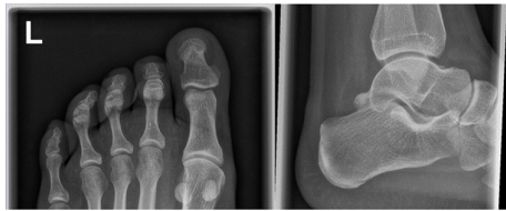
Figure 1 Radiograph of the patient's left foot showing no bony lesions.