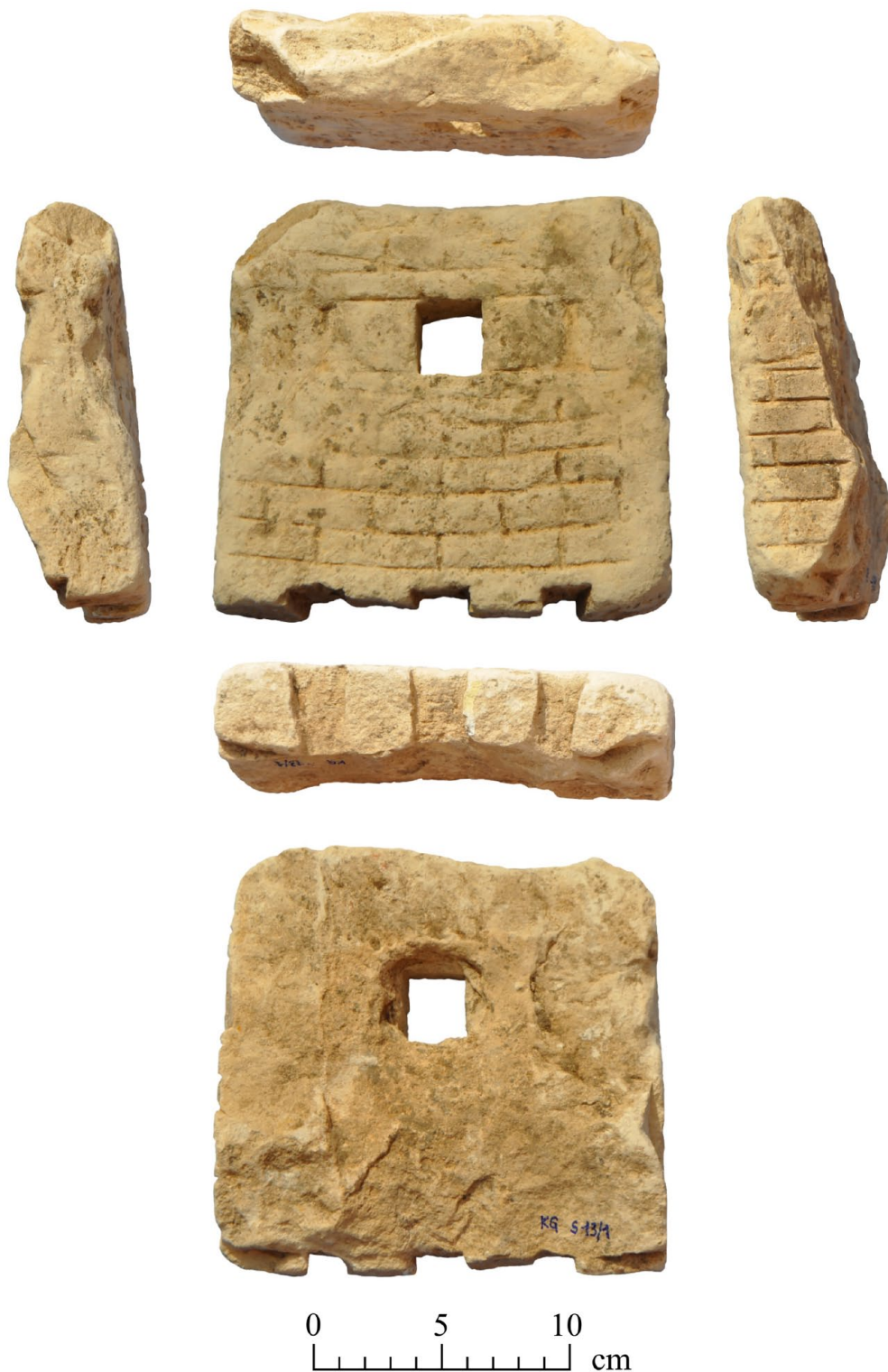
Fig. 2 Fragment of a tower house model, limestone, Kom el-Gir, inv. no. KG S 13/1 (illustration: Thomas Seidler).

excavations. The tell is today about 20 ha large and rises to a maximum of about 5 m above the surrounding fields. Based on pottery from the surface and from auger coring, the settlement's foundation is dated to the Ptolemaic Period and the site was occupied until the Late Roman, possibly Early Arab, Period. 11 Magnetic prospection of the site has provided images with numerous outlines of mudbrick houses, many of