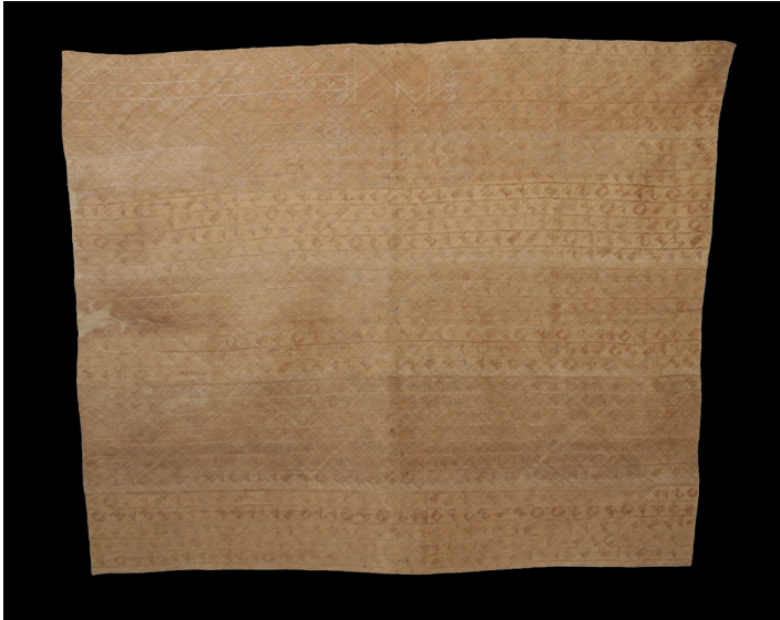
Fig. 3. Makaloa mat, woven by Kala'i-o-kamalino from the island of Ni'ihau, 1874.

public understandings through, ethnographic museums in Europe and the Americas.