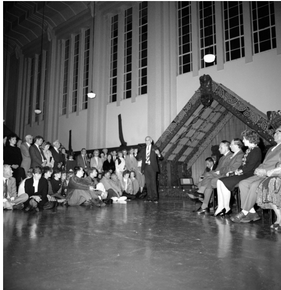
Fig. 2. Professor Hirini Moko Mead, academic and curator of the exhibition Te Maori, seen giving a talk at the National Museum, Wellington, Aotearoa New Zealand, 1986.

long history of Indigenous engagement with the method, the practice, the doing of curation – in this case, through the figure of the kaitiaki , the guardian, caring for taonga , or treasures. In figure 1, one sees the Māori carver Thomas Heberley directing work on the carved store house Te Tākinga in preparation for the opening of the Dominion Museum in Wellington in the mid-1930s. In figure 2, Professor Hirini Moko Mead, academic and curator of the exhibition Te Maori , is seen giving a talk at the National Museum in Wellington in 1986. The Te Maori exhibition was a milestone in the so-called Māori cultural renaissance. First touring several high-profile institutions in the United States, it returned to Aotearoa New Zealand to make an impact upon Indigenous resurgence, revitalization and sovereignty (McCarthy et al. 2019). Exhibitions, as these examples show, do not simply represent, and they also do more than simply mean. They intervene in the environments in which they are embedded, remaking and redoing worlds.