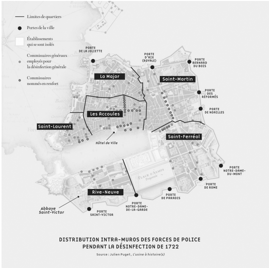
Figure 3: Distribution of commissaires throughout Marseille's urban area during the disinfection campaign of autumn 1722. The map, whose graphic design was conceived by Vinciane Clemens, was produced by the History Museum of Marseille (MHM).

to disinfect places of worship, while forty new commissaires were appointed for the rest of the city. They were split into groups along the city centre's principal axes (around the port, the Cours, the Canebière, the streets neighbouring on Hôtel de Ville and the Hôtel-Dieu), a strategy which, in effect, enabled them to closely scrutinize the adjacent streets. The commissaires were positioned precisely where scrupulous vigilance was called for: the area around Hôtel de Ville, the hub of municipal authority and headquarters for the bureau de police from which the teams were dispatched; along the port and around the Cours and the Canebière, the major areas for shipping and commercial trade. More than 46 commissaires thoroughly controlled the Accoules district, while the la Major district was entrusted-