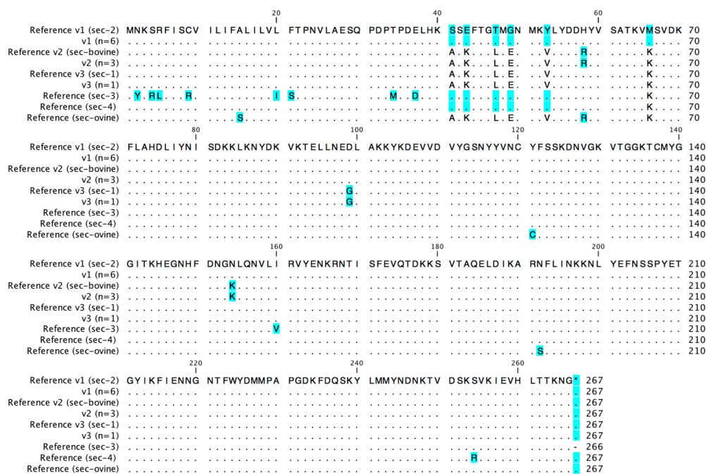
Figure 2. Amino acid variants of SEC. Amino acid exchanges compared to the most common amino acid detected are highlighted in blue ( n = number of strains representing each variant).

Screening the strains exhibiting sec for SEC production using SET-RPLA led to detection of SEC in all strains, showing that all sec variants are expressed.