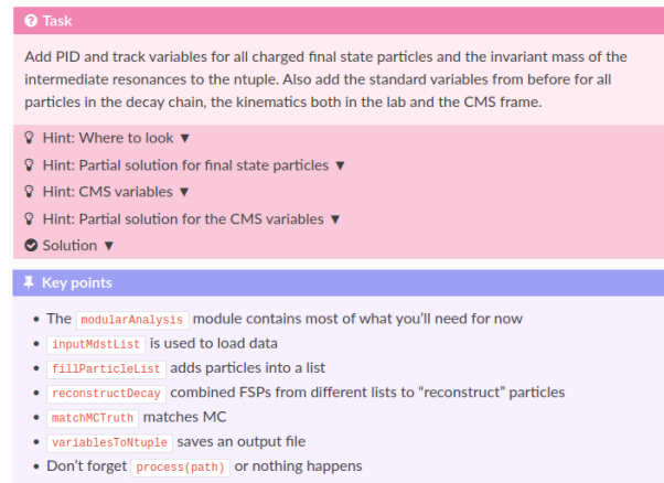
Figure 2: An exercise with hints and solution (top) and an overview box (bottom)

A possible future direction is to consider more and more lessons as requirements to be completed before our events and then focus on more complicated exercises to be solved in teams with mentors.