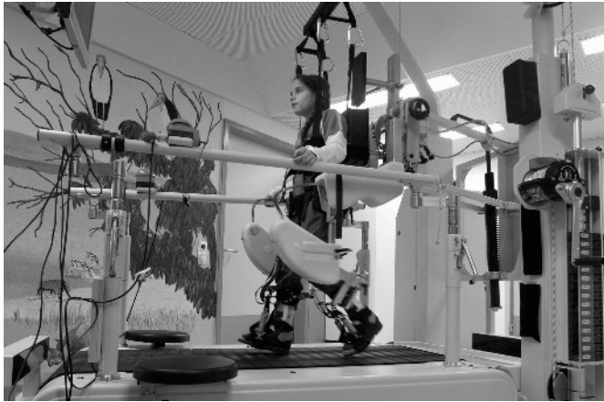
Figure 1 Robotic-assisted locomotion training of a 12-year-old girl with cerebral palsy on the driven gait orthosis (Lokomat®).

In a mean (SD) of 15.1 (4.1) training sessions, patients walked a mean (SD) of 842 (291) m during a mean (SD) of 31.5 (7.1) minutes per session on the DGO. Individual details of the gait training data and of the outcome parameters are shown in tables 2 and 3.