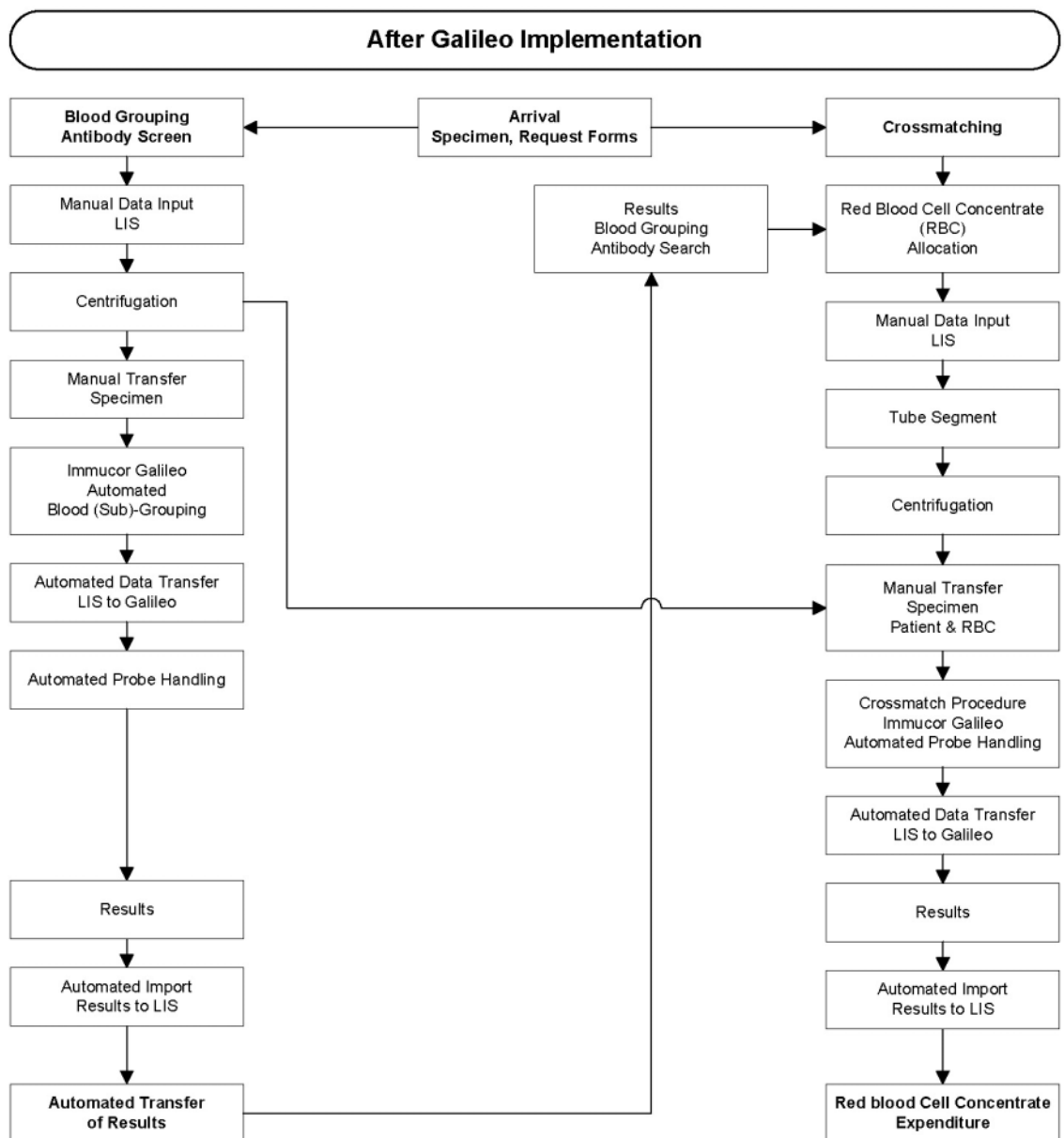
Fig. 2. Abbreviated process workflow after the implementation of the Immucor Galileo system.

veal any discrepancies. Discrepancies were observed in antibody screening comparing the last 30,000 consecutive antibody screenings done with the previously used methods and the first 30,000 screenings of the Galileo system. The Galileo system revealed significantly more probes with initially positive antibody search than our previous methods: 6 (1,789/30,000) versus 4% (1,193/30,000), p < 0.01 chi-square test (Sigma-Stat 3.5, Systat software GmbH, Erkrath, Germany). In the Galileo cohort two clinically highly significant antibodies against public antigens Anti-Vel and Anti-AnWj reacted only in the Galileo system. The increase in the Galileo system of low-reactive antibodies such as Anti-Jka ( n = 7 ), Anti-Jkb ( n = 5 ), Anti-Fya ( n = 3 ), and Anti-Fyb ( n = 4 ) not detected by a consecutive testing in our previously used methods was remarkable.