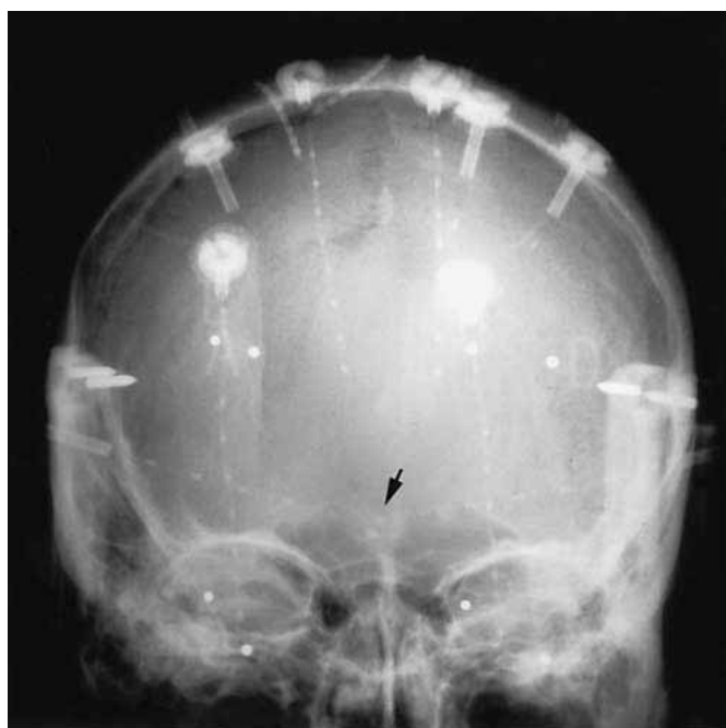
Fig. 1. The arrow points to the area of contact No. 1 of the left orbitofrontal electrode.

Outcomes were classified using a slight modification of Engel's [12] criteria: seizure free (class I), rare or less than 3 seizures per year (class II), greater than 90% decrease in seizure frequency (class III), and less than 90% decrease in seizures (class IV). Five-year follow-up data were available in all cases. Two patients had class I outcomes and underwent further analysis. For this analysis, we reviewed video/EEG recordings of our 2 patients and case descriptions of the 2 patients from the literature.