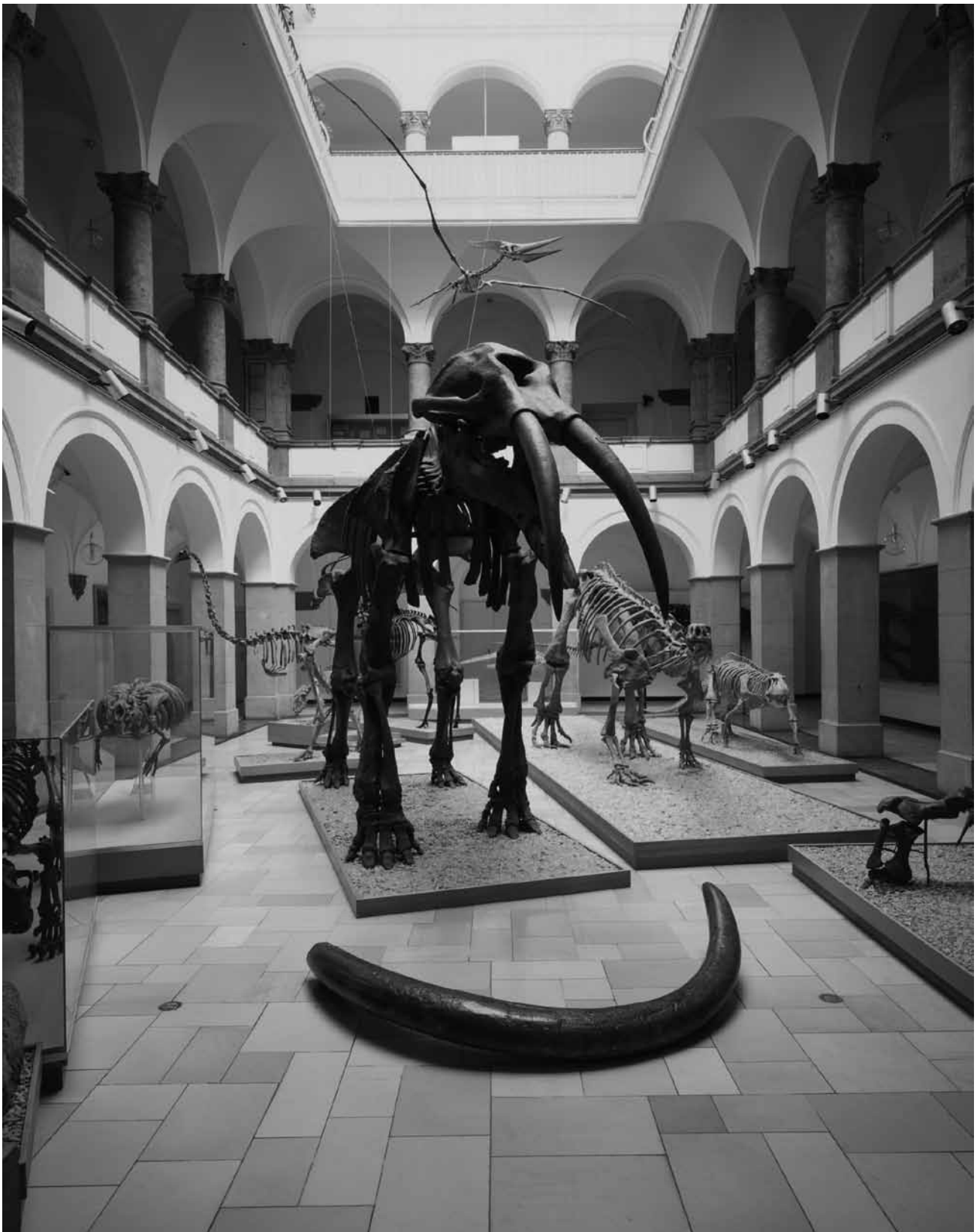
Atrium of the Paläontologisches Museum München with Gomphotherium aff. steinheimense as centerpiece