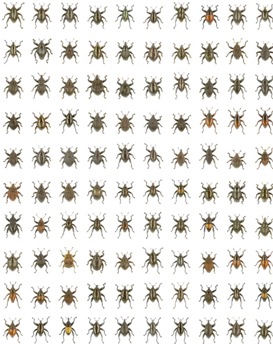
Figure 3 Compilation of 100 new Trigonopterus species.

we anticipate that such a decision is still decades away. Until that day, the contest between descriptions containing DNA barcodes and the ones without may give an answer of what data is really needed.