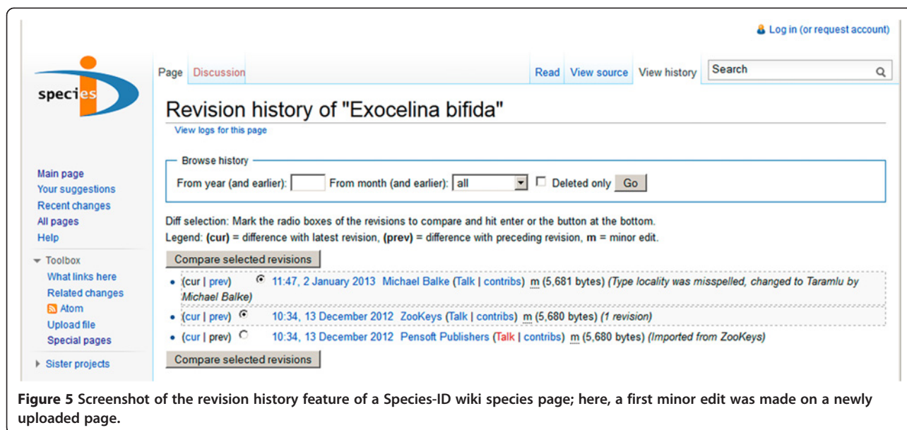
Figure 5 Screenshot of the revision history feature of a Species-ID wiki species page; here, a first minor edit was made on a newly uploaded page.

would surely fit well into the concept of ZooBank. At a time when the idea of open-source is spreading and researchers begin to see dissemination of their works as their obligation and not as a source of income, the biggest problem towards a unitary taxonomy may have disappeared already. If a suitable infrastructure was provided by ZooBank, a critical mass of researchers would start uploading images, diagnosis-texts and sequences to obtain immediate publication and permanent storage on an Official Database of Zoological Nomenclature. The ICZN should team up together with major natural history museums around the world, provide the necessary cyber-infrastructure and make additional relevant changes to the Code. The BOLD system [link to www.boldsystems.org ] [40] could serve as a source of inspiration, because data upload is easy, and each individual can have its own voucher page with images that show what the voucher looks like, maps where it comes from, collecting data, sequences, trace files and most importantly information where the voucher physically IS (e.g. Voucher of Batrachedra praeangusta link to http://www.boldsystems.org/index.php/Public_RecordView?processid=LBCH3416-10 ).