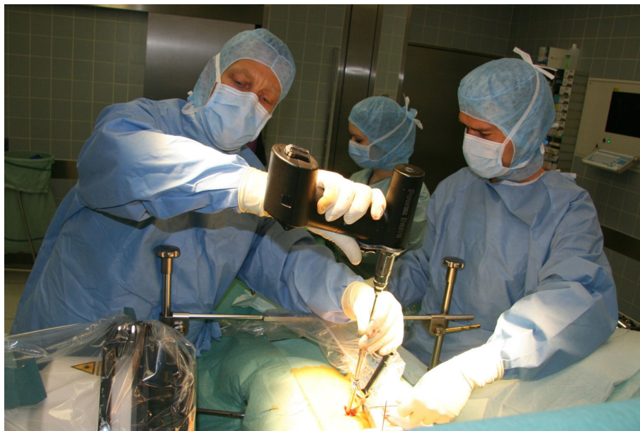
Figure 2 Shows the percutaneous drilling of a GO-LIF screw trajectory, using the drill sleeve. Lateral fluoroscopy is used to control for depth.

The imaging modalities to be used in this study are plain radiographs and computed tomography (CT). The pre-operative CT, which is required to define the surgical anatomy, will be saved in such a way that it can also be used for the preoperative planning and the intraoperative navigation. A routine postoperative CT of the instrumented vertebrae will be acquired to evaluate implant positioning and to exclude intraspinal bleeding. This scan will also be used to compare the planned position of the GO-LIF implants to their real position and hence serve as a parameter for the safety of the procedure. Any implant deviations from the planned position will be measured and categorized in 1 millimeters increments. This data will be presented and discussed in full. Implants penetrating the pedicular or the vertebral cortex by more than 4 millimeters will be categorized as