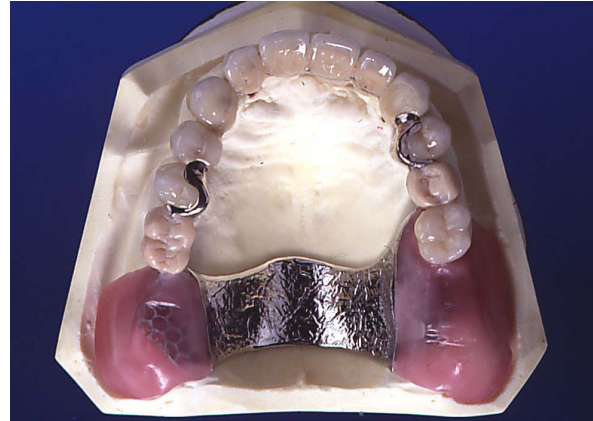
Figure 2 Example of treatment A.