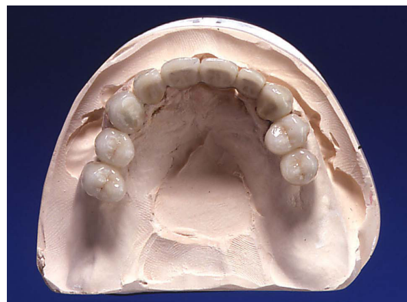
Figure 3 Example of treatment B.