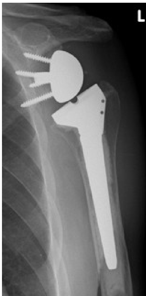
Figure 4 Antero-posterior radiograph of a 74 year-old female patient's left shoulder with an implanted inverted total shoulder prosthesis Delta at 64 months of follow-up.

Radiological analysis reveals with "grade 3 = erosion up to the inferior screw" of infraglenoidal scapular notching according to Nerot.