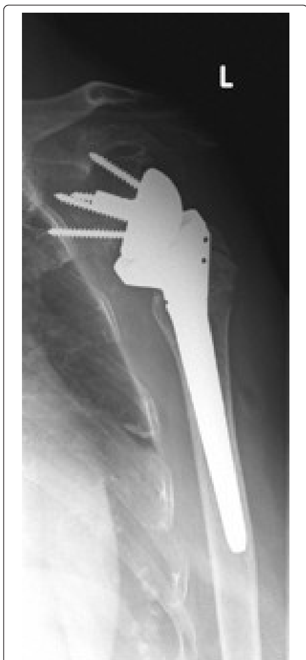
Figure 2 Antero-posterior radiograph of a 56 year-old male patient's left shoulder with an implanted inverted total shoulder prosthesis Delta at 52 months of follow-up. Radiological analysis reveals "grade 2 = notch with condensation" of infraglenoidal scapular notching according to Nerot.