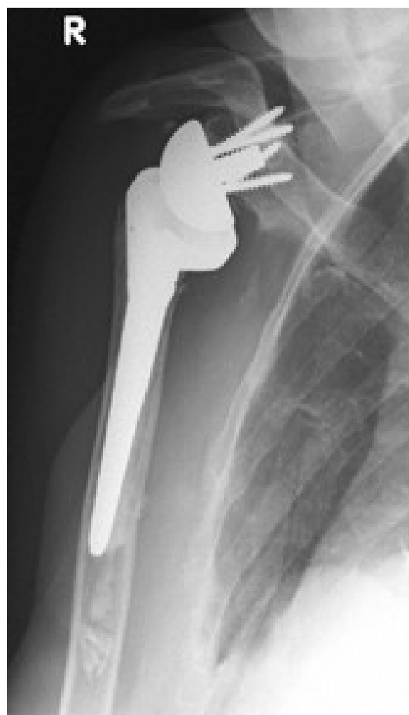
Figure 7 Antero-posterior radiograph of a 69 year-old female patient's right shoulder with an implanted inverted total shoulder prosthesis Delta at 44 months of follow-up.

Radiological analysis reveals "grade 4 = erosion over the inferior screw with extension under the base plate" of infraglenoidal scapular notching according to Nerot.