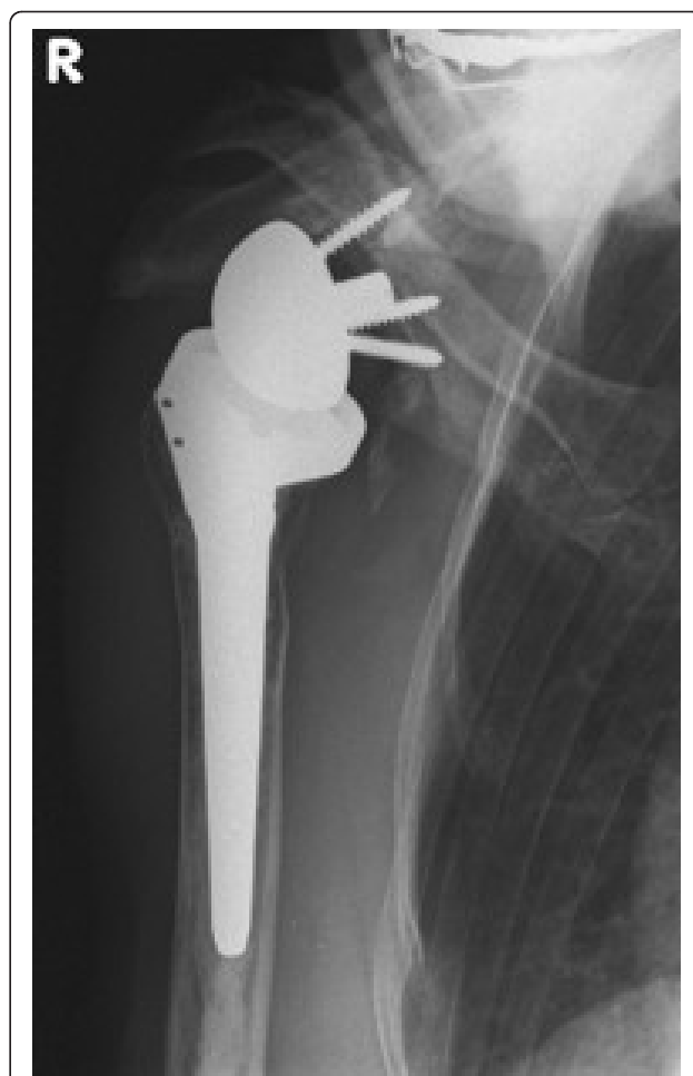
Figure 3 Antero-posterior radiograph of a 64 year-old female patient's right shoulder with an implanted inverted total shoulder prosthesis Delta at 39 months of follow-up. Radiological analysis reveals "grade 4 = erosion over the inferior screw with extension under the base plate" of infraglenoidal scapular notching according to Nerot.

Presented percentages correspond to the sum of measurements as two investigators evaluated X-rays twice resulting in 4 measurements for each patient and not to the single patients. The reliability of the radiological evaluation was evaluated by use of a Kappa