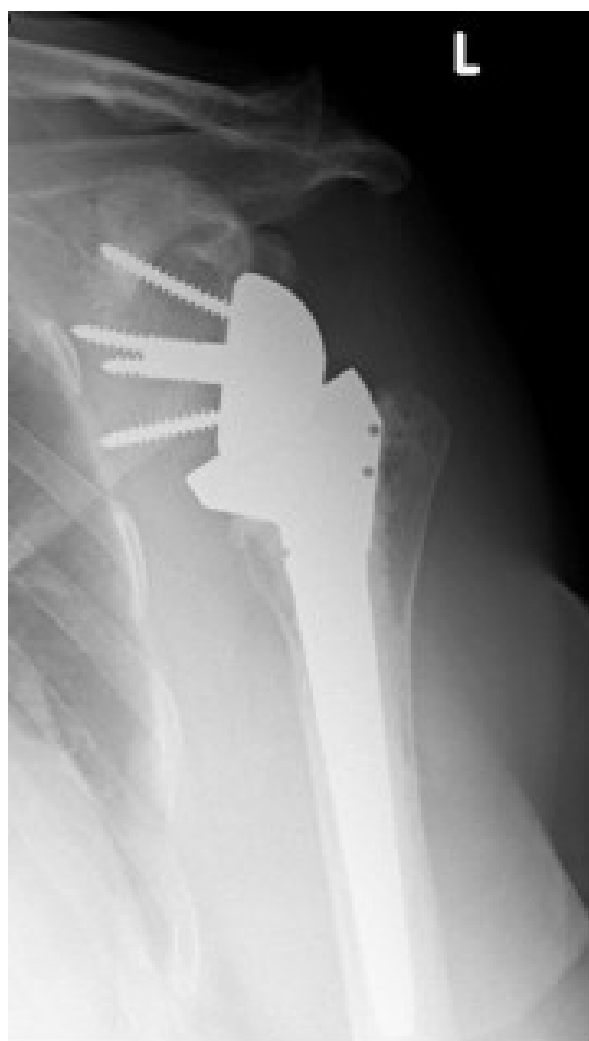
Figure 6 Antero-posterior radiograph of a 75 year-old female patient's left shoulder with an implanted inverted total shoulder prosthesis Delta at 32 months of follow-up.

Radiological analysis reveals "grade 4 = erosion over the inferior screw with extension under the base plate" of infraglenoidal scapular notching according to Nerot.