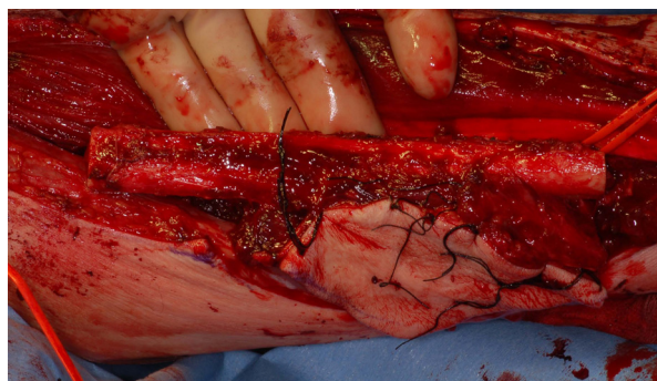
Figure 2 Fibular flap harvested from the right lower limb.

Two years after the first surgical intervention, the patient received a second mandibular reconstruction without recurrence on 4 May 2009. A fibular osseomusculocutaneous flap was harvested from the right lower limb, transplanted in the mandibular defect site, and fixed with a reconstruction plate (see fig. 1c and fig. 2). The artery was re-anastomosed to an appropriate vessel in the area of the main branch of the arteria thyroidea. Because of the lack of small vessels, venous anastomosis was done at the internal jugular vein. No complications occurred during the first 60 postoperative hours (see fig. 3a). The flap developed venous failure visible by livid skin color 60 hours after surgery (see fig. 3b). The venous part of the pedicle showed a massive thrombus at revision surgery (see fig. 3c). The clot was removed and the flap was perfused with 3 ml heparin solution (5000 I.E./ml), which was injected in the pedicle artery three times, resulting in high frequency coagulation of the punctual bleeding. The flap showed recovery of the venous function 6 hours after revision surgery detectable by the fading of the dissemi-