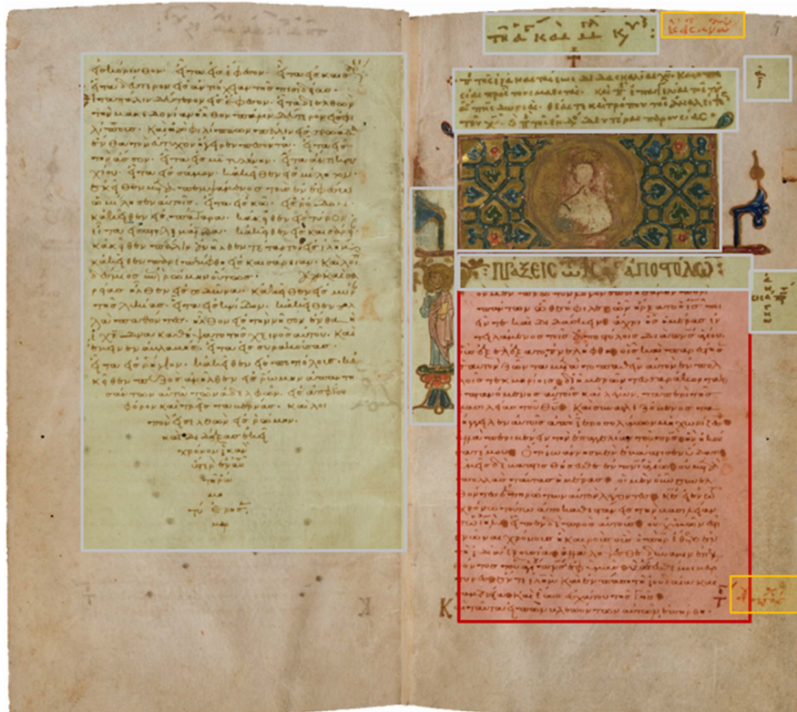
Fig. 1. Basel, Cod. AN IV 2, ff. 4v–5r.

subgroup, all the traditional paratexts whose presence is standard in a Byzantine codex, such as the title at the beginning of the Gospels; it also includes the more ‘optional’ traditional paratexts, such as subscriptions or evangelist portraits. In the second subgroup we find non-traditional paratexts which are unusual or even unique to a particular codex; examples of this type of paratexts are dedicatory epigrams and colophons. The presence of these paratexts is the result of a deliberate choice on the part of the codex’s manufacturers and they determine the character of this ‘publication’; (2) all the so-called ‘post-manufacture’ paratexts, meaning every piece of content which was added to the book after it was already in circulation. These paratexts were not part of the initial project behind the book.