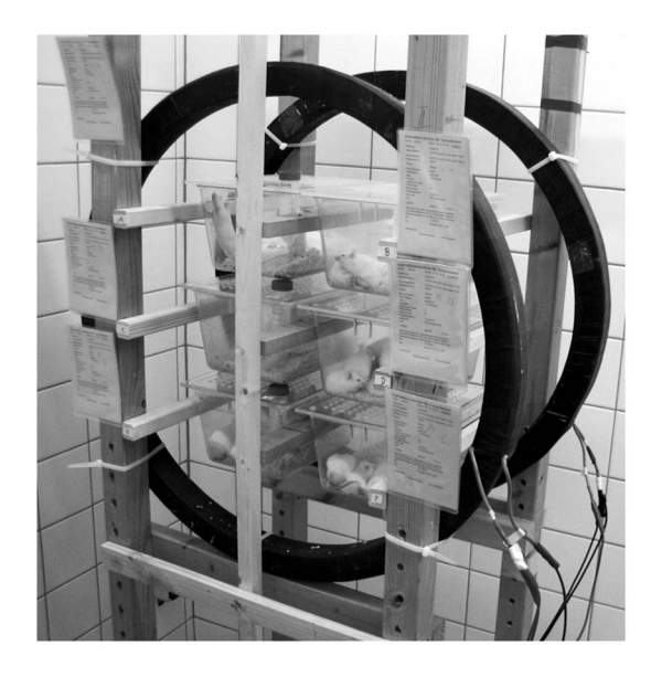
Figure 1. Experimental set-up of the 50 Hz MF exposure of the present study. Details are provided in the main text. doi:10.1371/journal.pone.0109774.g001

Mice were divided into three groups. Groups A and B were MF exposed (A: 0.1 mT, n = 30; B: 1.0 mT, n = 30); mice in group C were unexposed (n = 26). After an eight week interval with or without 50 Hz MF exposure, 10 mice each group—stemming from different cages—were randomly selected and brought to another room where they received an intraperitoneal injection of 555 kBq [methyl-³H] thymidine (³H-TdR; 2,664 GBq/mmol; American Radiolabeled Chemicals, St. Louis, MO, USA) per g body mass (b.m.) within 5 min of removing the animals from the MF exposure. Each mouse was anaesthetized with chloral hydrate (10% aqueous solution, 0.005 ml/g b.m., i.p.) 115 min after ³H-TdR injection and killed 5 min later (i.e., two hours after ³H-TdR injection) by intracardial perfusion with the following solutions in a