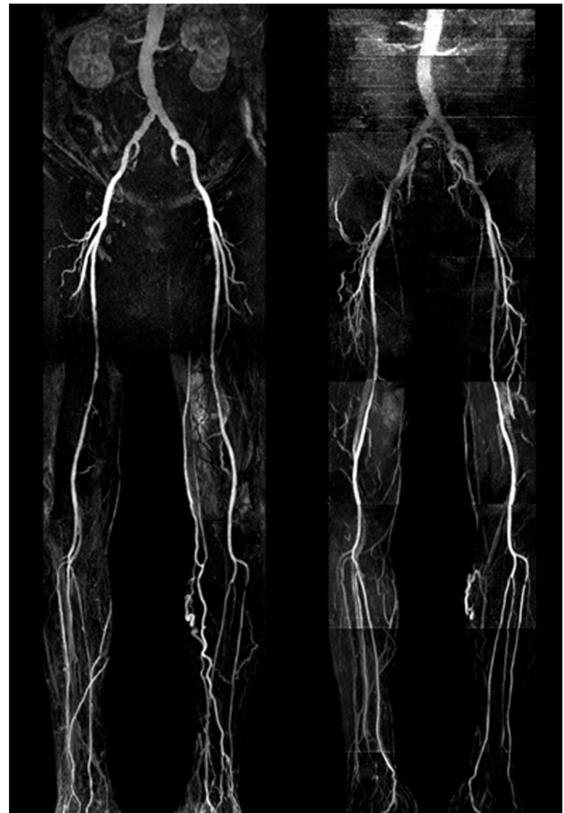
Figure 2. Contrast-enhanced continuous table movement (left) and non-enhanced HR-QISS (right) MRA in a 68 y/o male patient suffering from PAOD stage IV. The examination was performed after percutaneous transluminal angioplasty (PTA) of the right superficial femoral artery. Both CE-MRA and HR-QISS depict multiple significant ( > 50\% ) stenoses in the right superficial femoral artery, an occlusion of the right anterior tibial artery and a single significant short-distance stenosis in the proximal left anterior tibial artery. Note the slightly better image quality of CE-MRA in the distal aorta due to motion artifacts in the HR-QISS sequence. On the other hand, non-enhanced HR-QISS shows less venous overlay. doi:10.1371/journal.pone.0091078.g002

In summary, 176 segments were rated as significantly stenosed or occluded (grade 2 or higher) in the CE-MRA reading. Within this subgroup, using HR-QISS, 62 segments (35.2%) were rated as highly stenosed (grades 2 and 3) and 114 segments (64.8%) were rated as occluded (grade 4). For CE-MRA, 58 segments (33.0%) were classified to have a high-grade stenosis and 118 segments (77.0%) to have an occlusion.