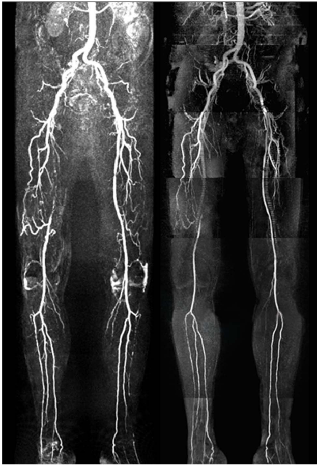
Figure 3. Contrast-enhanced (left) and non-enhanced HR-QISS (right) MRA in a 72 y/o male with PAOD stage IIb. CE-MRA and HR-QISS findings show excellent correlation. Both techniques reveal a long-distance occlusion of the right superficial femoral artery. The right superficial femoral artery is reconstituted via collaterals from the deep femoral artery. Further occlusions are found in both fibular arteries and the proximal left anterior tibial artery. High-grade stenoses are located in the right anterior tibial artery and in the left superficial femoral artery. doi:10.1371/journal.pone.0091078.g003