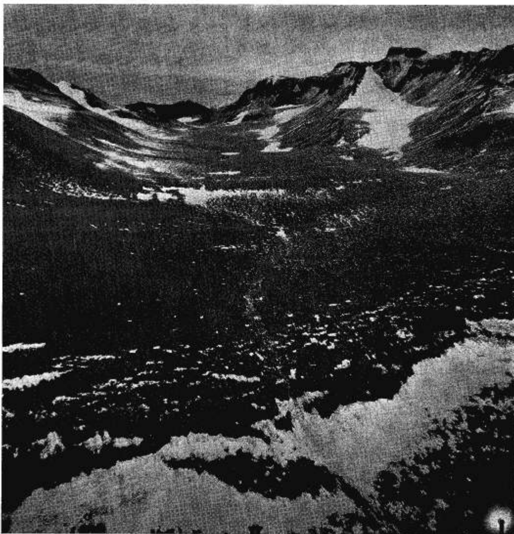
Fig. 1. Southwestern view of entire length of Wheeler Valley, Southern Victoria Land, Antarctica.

ration rate, and solar radiation flux, that Wheeler Valley, in common with nearly all the other dry valleys, is subject to diurnal-freeze thaw cycles, with temperatures below freezing during the late afternoon through early morning. For the period of recorded measurements, December 27, 1967 to January 4, 1968, maximum temperatures were as follows: air 1 m. = +1^{\circ}\text{C} , soil surface, = +15^{\circ}\text{C} ; soil 5 cm. = +7^{\circ}\text{C} ; soil 15 cm. = +1.5^{\circ}\text{C} . Minimum temperatures were air 1 m. = -12^{\circ}\text{C} , soil surface, = -5.8^{\circ}\text{C} ;