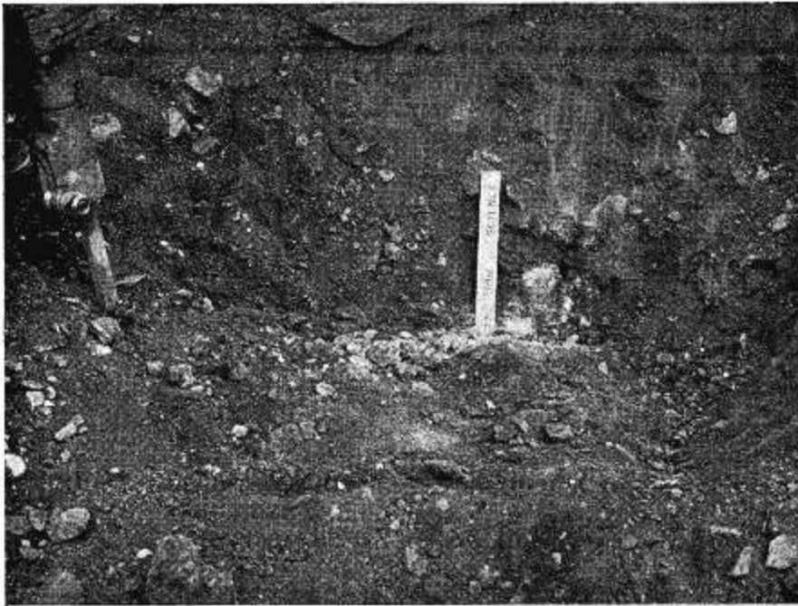
FIG. 3. Soil sample site 609-612, showing Jack-hammer excavation of exposed soil profile and frozen ground table.

collected by aseptic techniques previously developed for desert soils (10). Standard methods recommended for arid soils were used for the determination of soil texture, pH, and electrical conductivity (23). Using micro techniques, organic and inorganic carbon were analyzed by wet combustion and gravimetric determination of absorbed \text{CO}_2 , and nitrogen was determined by the Kjeldahl method (21). All cations and anions were determined by colorimetry, flame photometry, or atomic absorption spectrometry following 1:5 soil water extraction (15, 21). The modified barium-chloride triethanolamine procedure was used to determine cation exchange capacity (15).