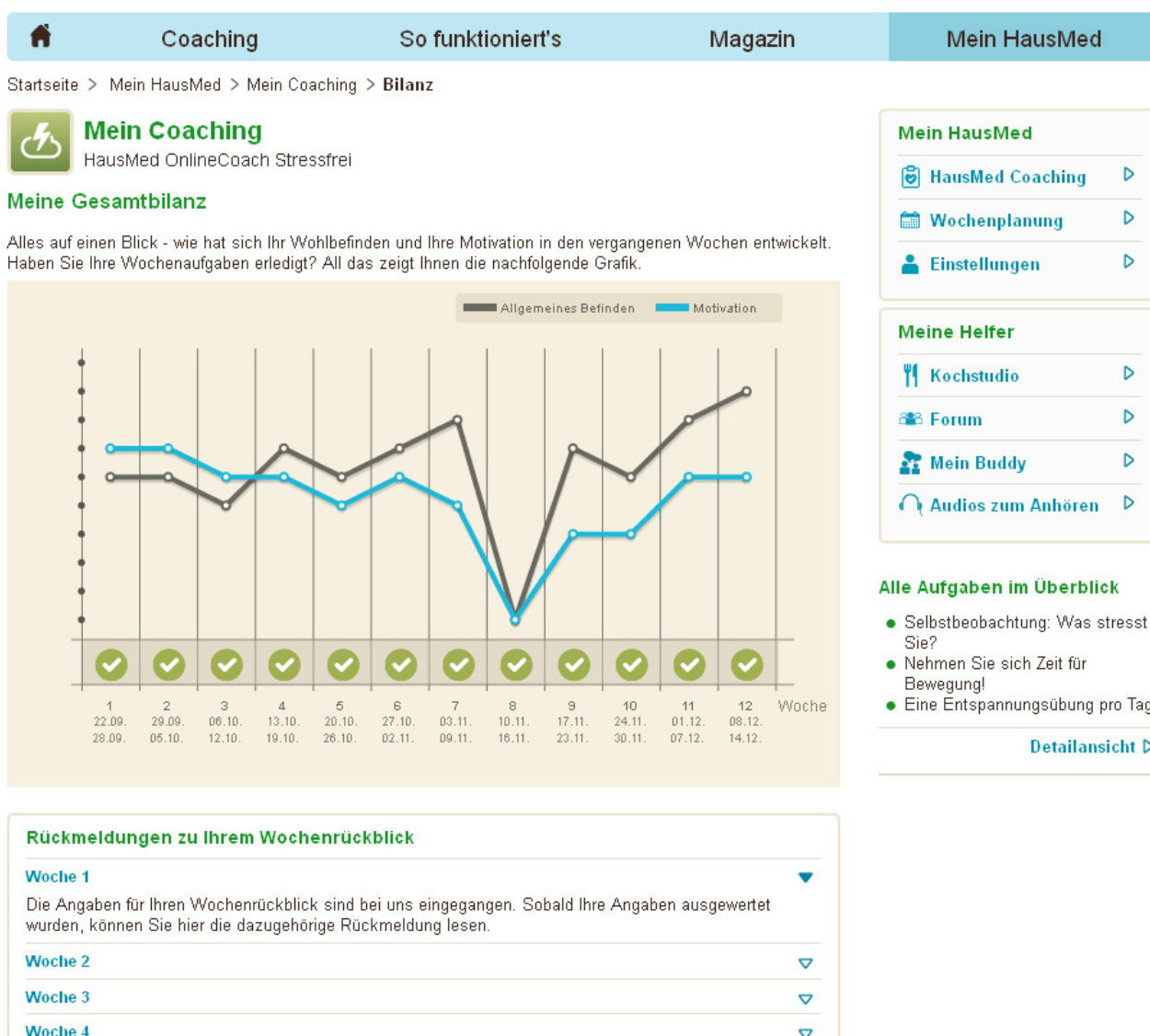
Figure 2. Screenshot of graph of condition (black curve), motivation (blue curve), and information about whether the weekly tasks were done or not (green check mark).