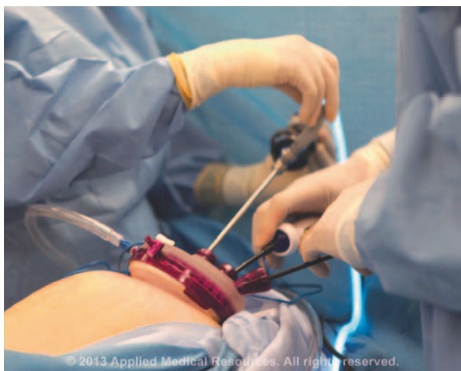
Fig. 1. Applied Medical gel port for single-incision laparoscopic surgery.