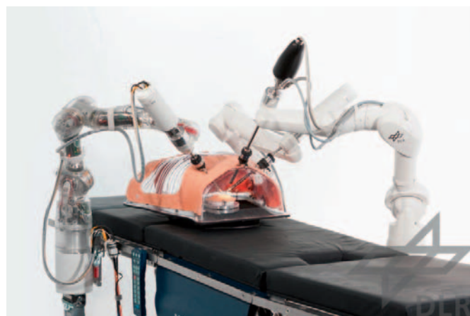
Fig. 3. DLR MiroSurge System for robotically assisted laparoscopic surgery (courtesy of Mr. Holger Urbanek, Institut für Robotik und Mechatronik, Deutsches Zentrum für Luft- und Raumfahrt).