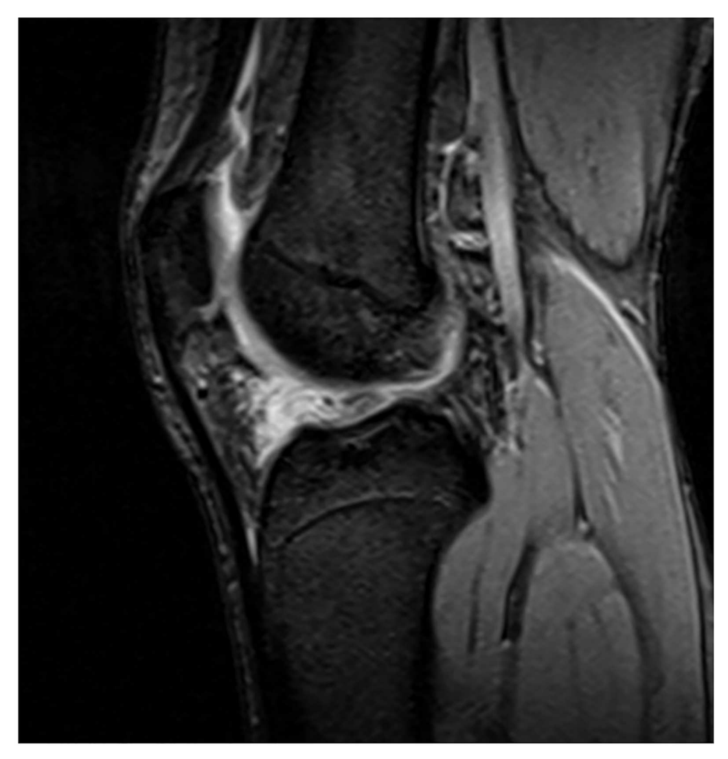
Fig 1. Sagittal proton density-weighted MRI of the knee of a 21-year-old male show that the disorder and irregular strip-like signal was observed in the AHLM and articular capsule.