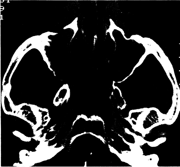
Figure 1. CT scan of inverted papilloma of right nasal cavity and nasopharynx.