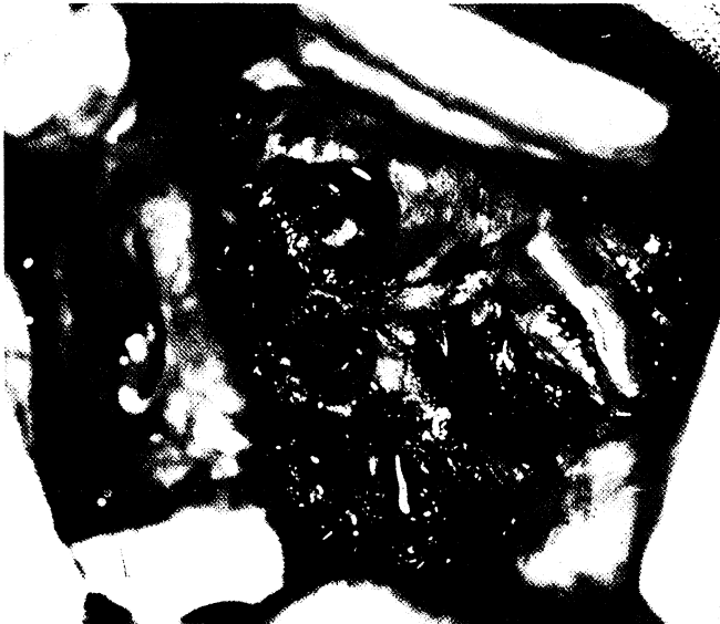
Figure 4. Intraoperative situation after left maxillectomy and orbital exenteration via midfacial degloving.

Exposure of the midface by degloving was followed by maxillary resection with orbital exenteration. Dura also had to be resected and submitted to plastic treat-