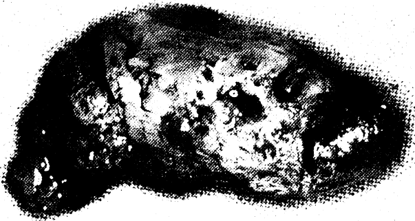
Figure 2. The resected tumour