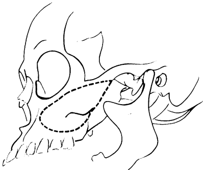
Figure 5. Dotted line: Parts of maxillary wall and zygoma to be resected for access to retromaxillary space via midfacial degloving.

At the end of the intervention, the temporarily removed bone fragment was repositioned and fixed again. Even the patient himself noticed no appreciable post-operative changes except for a slight soft-tissue swelling that receded completely with a few weeks.