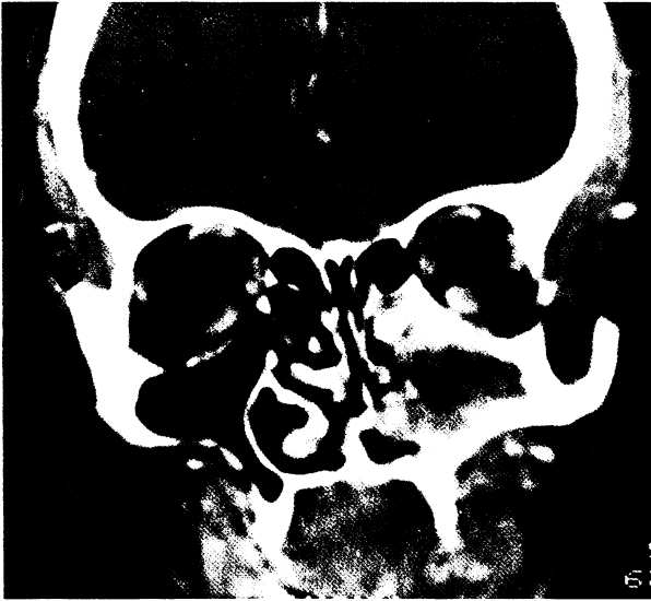
Figure 3. CT scan of carcinoma of left maxillary sinus.