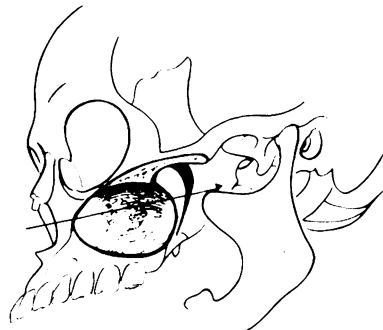
Figure 6. Anterior operative access to retromaxillary space after bone resection (Figure 3a) through midfacial degloving.