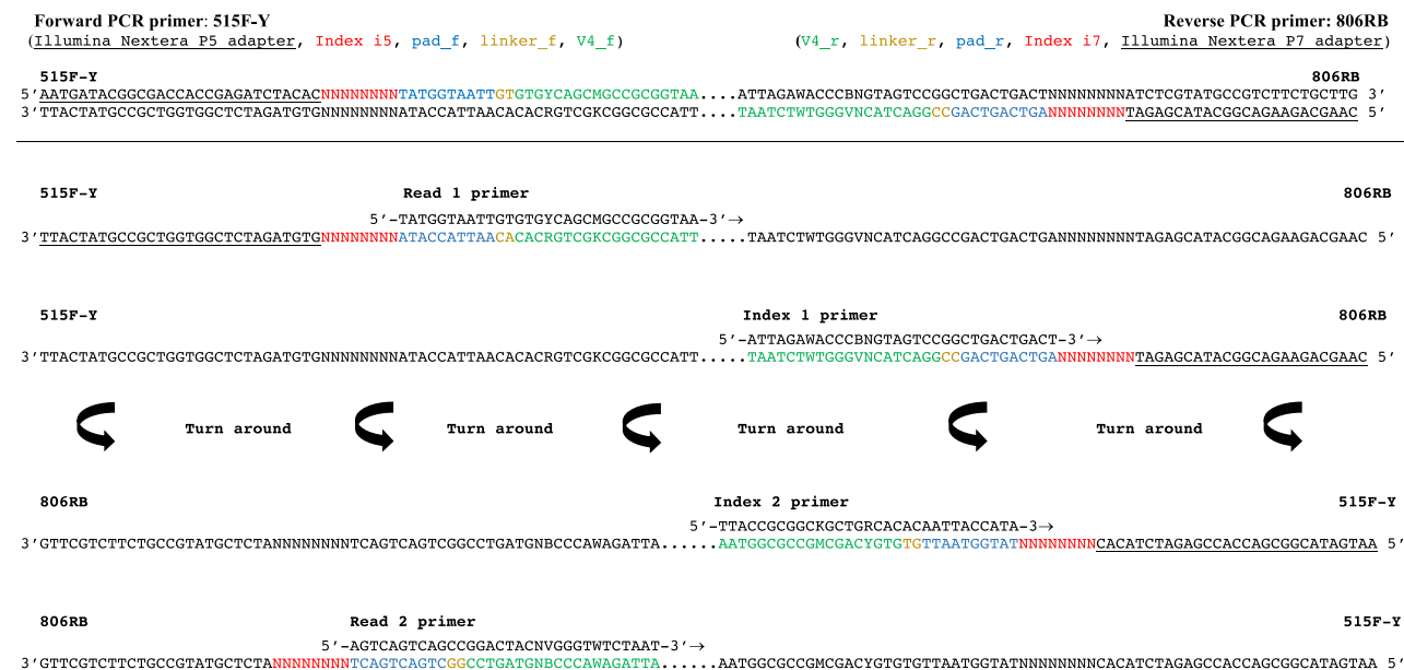
FIGURE 1 Schematic description of the dual-index sequencing strategy on the MiniSeq. Reading the figure from top to bottom shows the sequential order of paired-end sequencing steps (four total). “Turn around” indicates the step of paired-end turn around on the flow cell surface. The sequencing proceeds in the direction of the flow cell surface, which in this figure is located on the right side (arrows point in direction of sequencing reaction). Sequencing starts by using Read 1 primer to sequence Read 1, followed by Index 1 primer to generate Index 1. The MiniSeq only uses the oligonucleotides on the flow cell for bridging and both the second index and the paired read are sequenced after the clusters are turned around. Hence an Index 2 primer is needed to sequence Index 2. Read 2 is then sequenced by using the Read 2 primer (after Kozich et al., 2013). Sequencing primers for only the forward primer 515F-Y (Parada et al., 2016) are shown, for sequencing primers needed for the 515F primer (Caporaso et al., 2012) please see Table 1 for all sequencing primers

We used the additional Index 2 sequencing primers to perform four paired-end 16S rRNA sequencing runs on the MiniSeq (Runs A–D). For all runs, we used the MiniSeq Mid Output Reagent Kit (300 cycles) including a reagent cartridge, a single-use flow cell and hybridization buffer HT1. To prepare our normalized amplicon libraries for sequencing, we followed the MiniSeq Denature and Dilute Libraries Guide (Protocol A) (Illumina 2016d) with some customizations. For run A, we combined 500 µl of the denatured and diluted 16S library (1.8 pM) with 20 µl of denatured and diluted Illumina generated PhiX