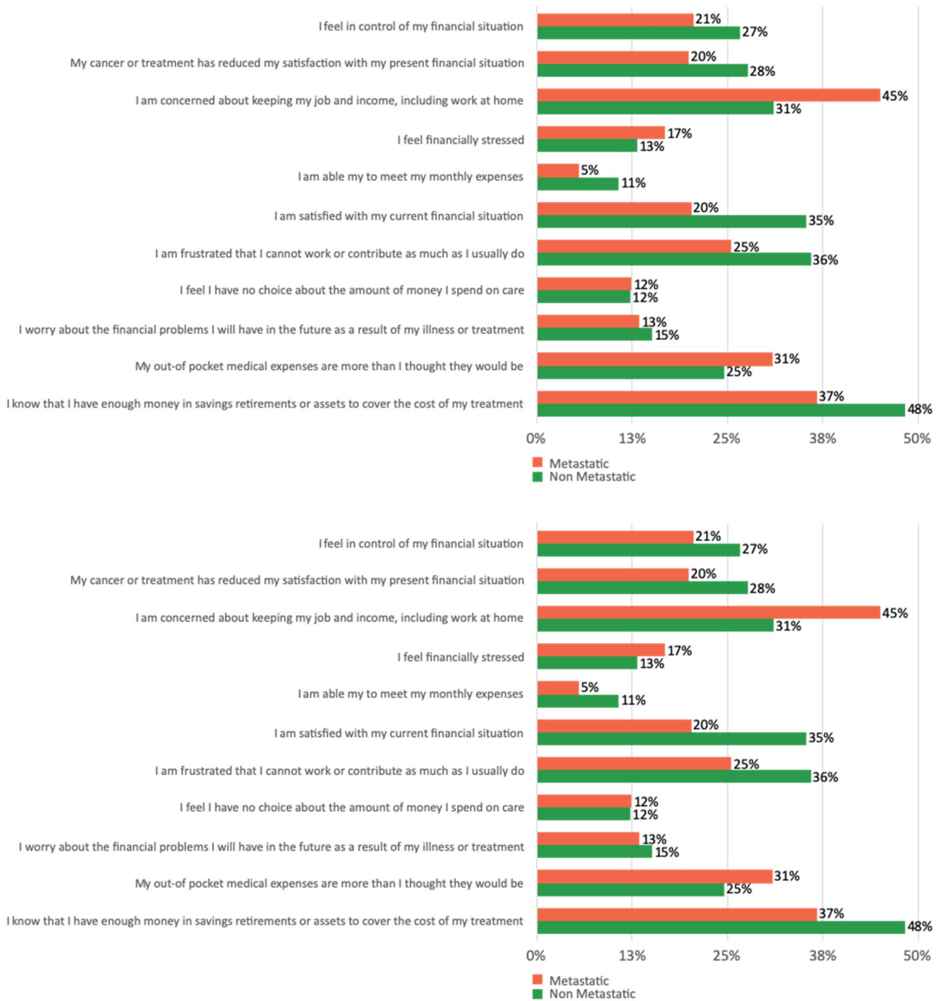
Fig. 2 COST Score with selection “not at all” comparing different topics between metastatic and non-metastatic respondents

Nationality and race were not correlated with financial distress in our dataset.