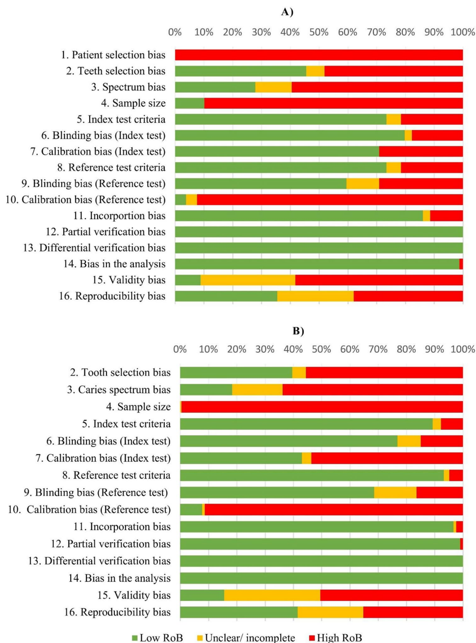
Fig. 2 RoB graph across included in vivo (A) and in vitro (B) caries diagnostic studies for occlusal surfaces. Item no 1 ( patient selection bias ) is only available for clinical diagnostic studies

a few conclusions can be drawn from the available data. The data support the generally and repeatedly published assumption that VE of pits and fissures is not perfect and needs to be accompanied by additional diagnostic methods. Nevertheless, more recently published criteria (ICDAS, UniViSS) that summarize the whole spectrum of non-cavitated caries lesions may help to overcome this drawback [16, 82–84]. Under in vitro conditions, VE showed mostly high SP values, while SE varied between the different methods and thresholds. A large difference between SE values was registered for VE under in vitro and in vivo conditions (Tables 3 and 4), which was also reported by Gimenez et al. [15].