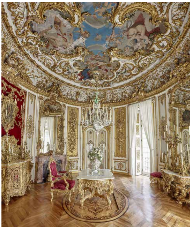
Fig. 2 Tischlein-deck-dich , Dining room, r. 9, Linderhof Palace