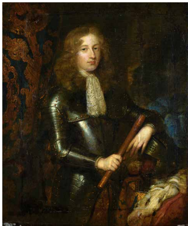
Fig. 3 Caspar Netscher: Markgraf Ludwig von Brandenburg , oil on canvas, ca. 1682

days. Through their accounts, we can recreate the moments that roused suspicions and which they thought worth relaying.