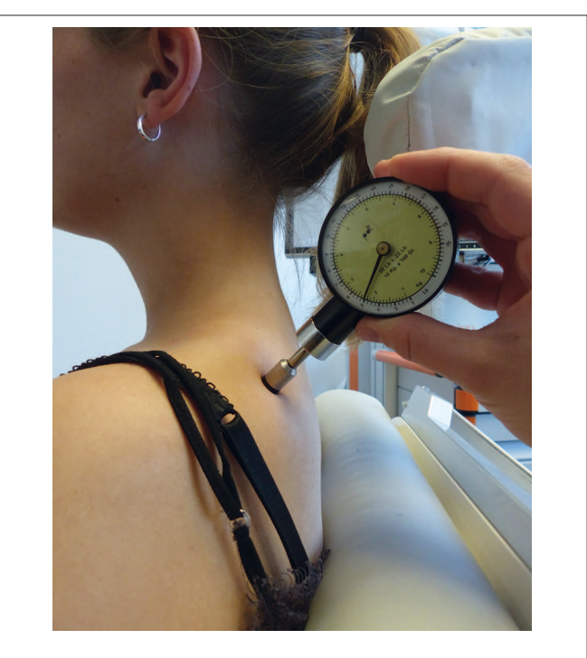
FIGURE 2 Measurements of the pressure pain threshold (PPT) by algometry. Measurements of PPTs were performed with a handheld algometer, which was placed perpendicularly to the skin with increasing pressure until the subject indicated that the local PPT was reached. Algometry was carried out on all four myofascial trigger points (mTrPs) in each subject. Specifically, three consecutive PPT measurements were performed separately for the two mTrPs in the trapezius muscles and the two mTrPs of the deltoid muscles prior and subsequent to the stimulation of each session.