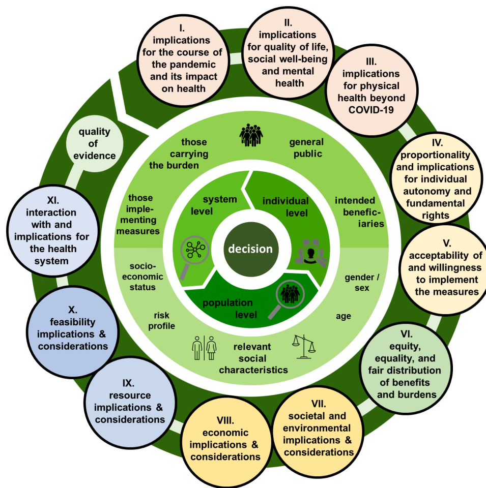
Figure 1 WICID framework version 1.0. The colour of the 11+1 criteria of the WICID refers to their grouping and relation to the criteria of the WHO-INTEGRATE framework they are derived from. The center-most circle describes population groups onto which the criteria and aspects should be applied to. The innermost circle describes the perspective the decision-makers can take onto criteria and populations. WICID, WHO-INTEGRATE COVID-19.

aspects, and the meta-criterion quality of evidence, to be applicable across all criteria and aspects (outer circle, figure 1; tables 1 and 2). Depending on the intervention, the criteria and aspects are intended to be applied on and reflected for different population groups (center-most circle, figure 1). Depending on the measure and type of decision-making process, the decision-makers are intended to deliberate on the criteria and aspects taking one or multiple different perspectives (inner circle, figure 1). Analogous to the WHO-INTEGRATE framework, it aims to accommodate different features of complexity: depending on the impact the measure is assumed to have on the system it is implemented in, direct (those caused by the intervention) and indirect (those resulting from the system reactively changing due to the intervention) effects should be taken into account, as well as local, regional, national and even global implications. At the same time, both the immediate and the short, medium-term and long-term implications should be considered (figure 2). It is intended to guide the systematic reflection of the intervention in its context.