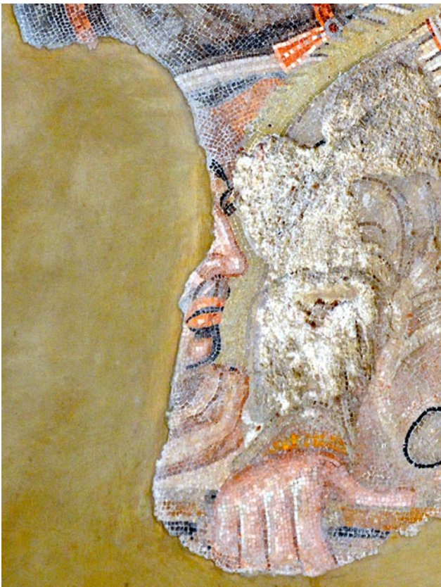
Fig. 2. Detail from the Alexander Mosaic, showing the right-hand man's portrait. MANN inv. 10020.

emphasize his special relationship with the king. These conditions best suit one of the protagonists in the power struggle that followed Alexander's death: a figure with the standing of Ptolemy I Soter, Seleukos I Nikator, or Lysimachos. Rumpf tentatively proposed, on iconographic grounds, that the figure might represent Ptolemy.