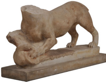
Fig. 8. Marble statue of a cat attacking a bird. Probably excavated in the Boubasteion at Naukratis, h. 23.0 cm, w. 12.0 cm, l. 49.5 cm. British Museum, inv. 1905,0612.5.