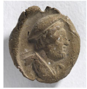
Fig. 11. Clay seal impression from Edfu, depicting a Late Ptolemaic ruler wearing kausia, diadem, and aegis, h. 1.40 cm, w. 1.30 cm. Royal Ontario Museum, inv. 906.12.68.

Our knowledge of Boubastis in Hellenistic Egypt has been enhanced by the discovery of the Alexandrian Boubasteion during rescue excavations at Kom-el-Dikka in 2009–10. 58 The sanctuary was first founded in the late 4th or early 3rd c. BCE, but a series of six foundation plaques record a major renovation by Berenike II, sister-wife of Ptolemy III Euergetes. 59 This royal initiative accords well with the Canopus Decree of 238 BCE, which reveals that the Boubasteia was moved to coincide with the Euergesia, a Ptolemaic dynastic festival. 60 Excavations in the sanctuary uncovered a series of pits containing offerings that had been dedicated to Boubastis prior to burial. Three pits contained limestone and/or terracotta cat statuettes comparable to the examples from Naukratis: one with 50 limestone cats and 469 terracotta cat figurines; another with 106 limestone cats; and a third with 13 limestone cats. Many reproduce the cat-and-bird motif familiar from the House of the Faun emblema, further suggesting a specifically Egyptian connection.