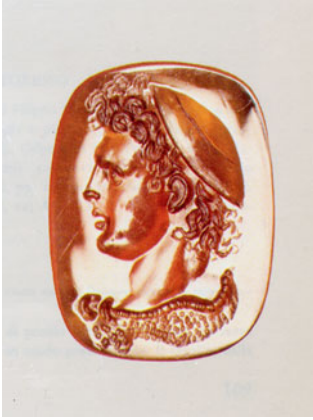
Fig. 9. Carnelian intaglio from the House of the Faun, with portrait of royal (?) figure wearing hemispherical hat and aegis, h. 2.24 cm, w. 1.71 cm. MANN, inv. 26766. (After Pannuti 1983, fig. 14.)