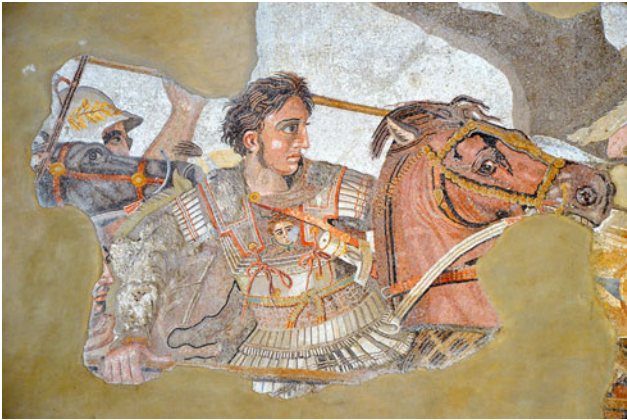
Fig. 1. Detail from the Alexander Mosaic, showing Alexander riding Boukephalos and the right-hand man standing directly at his side. MANN inv. 10020. (© Carole Raddato/Wikimedia Commons. The file is licensed under the Creative Commons Attribution-Share Alike 2.0 Generic license [ https://creativecommons.org/licenses/by-sa/2.0/deed.en ]).