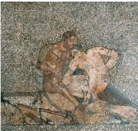
Fig. 6. Symplegma mosaic from Thmuis (Tell Timai) in the Nile delta. Central panel h. 82.5 cm, w. 84.5 cm. Alexandria, Graeco-Roman Museum, inv. 21738.

Eight pictorial mosaics were laid in the House of the Faun as part of a major renovation program of the early 1st c. BCE (Fig. 3). 42 As previous studies have recognized, 43 several have iconography linking them to Ptolemaic Egypt: