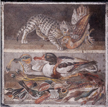
Fig. 7. Emblema from ala 15 of the House of the Faun, with split-level composition including the cat-and-bird motif, h. 51.0 cm, w. 57.0 cm. MANN, inv. 9993.