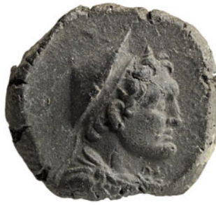
Fig. 10. Clay seal impression from Edfu, depicting Ptolemy I Soter wearing kausia, diadem, and aegis. Allard Pierson Museum, inv. 8177-230.