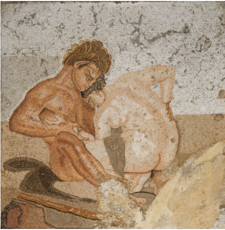
Fig. 5. Symplegma mosaic from cubiculum 17 of the House of the Faun, h. 39.0 cm, w. 37.0 cm. MANN, inv. 27707.