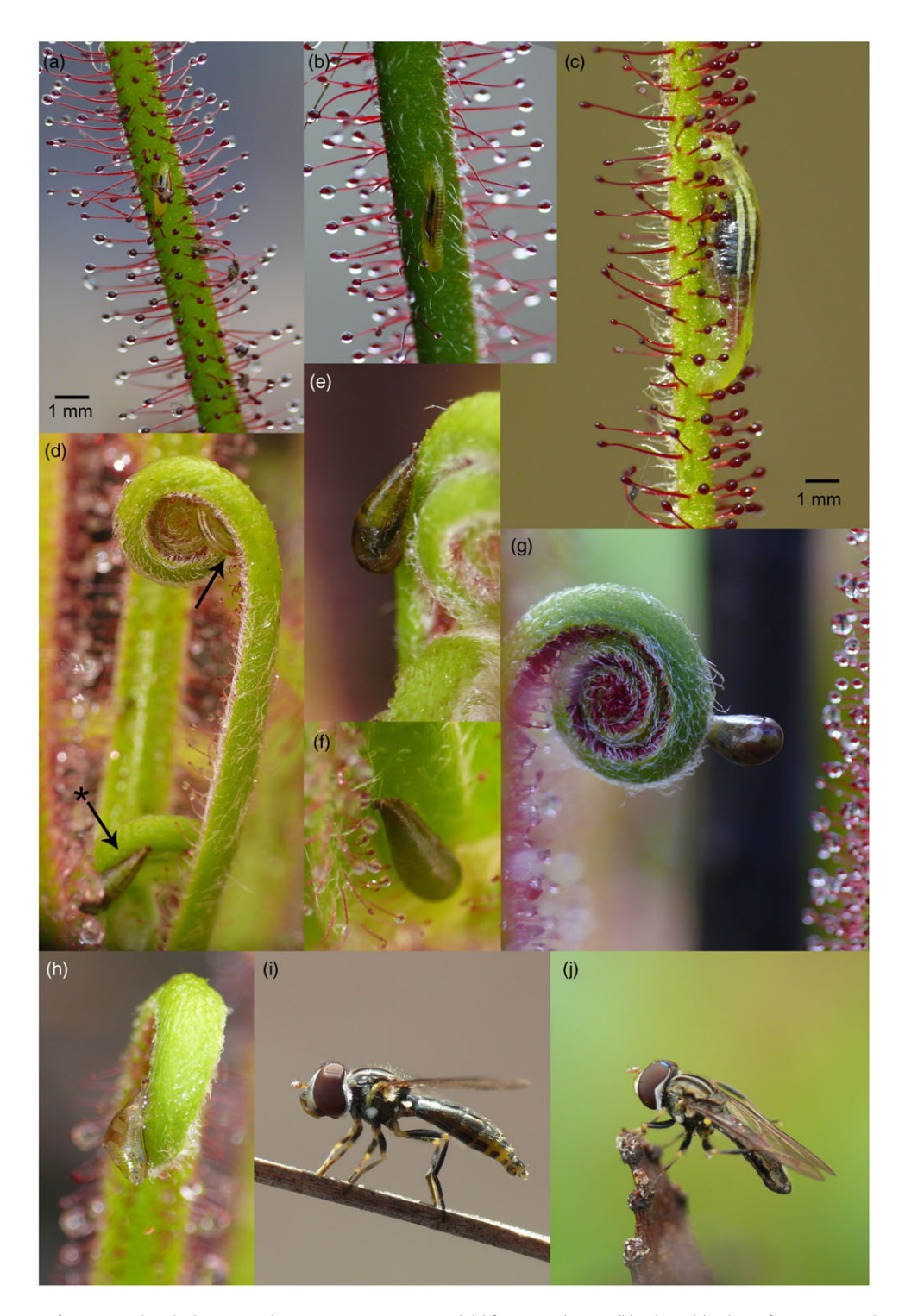
Figure 2. Life cycle stages of Toxomerus basalis documented in situ in Minas Gerais, Brazil. (a) first-instar larva L_1 (b) L_2 larva (c) L_3 larva, figures 1a–c to the same scale. (d) L_3 larva attaching to pupate on a freshly enrolling Drosera leaf (arrow), note another puparium (arrow with *) on a developing leaf in bud on the same plant. (e) Puparium. (f) L_3 larva starting to pupate on a leaf base. (g) Puparium with emerging pharate adult – note the translucent puparium exoskeleton with opening fissures visible at the anterior end. (h) empty puparium exuvia on a developing Drosera leaf. a–c on Drosera spiralis , Parque Nacional das Sempre Vivas, Buenópolis, Minas Gerais, 06 December 2018. (i) + (j) adults resting on exposed perches near their Drosera hosts: (i) female, Rio das Lajes, 06 December 2018. (j) male, summit of Pico do Padre Ângelo, 04 December 2018.