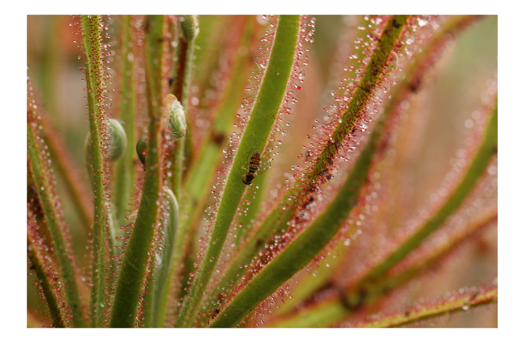
Figure 6. A female of Toxomerus lacrymosus apparently captured by the sticky tentacles of Drosera magnifica on Pico do Padre Ângelo, but which escaped on lower leaf surface. Note a syrphid egg (probably from T. basalis ) on the same leaf, right above the female.