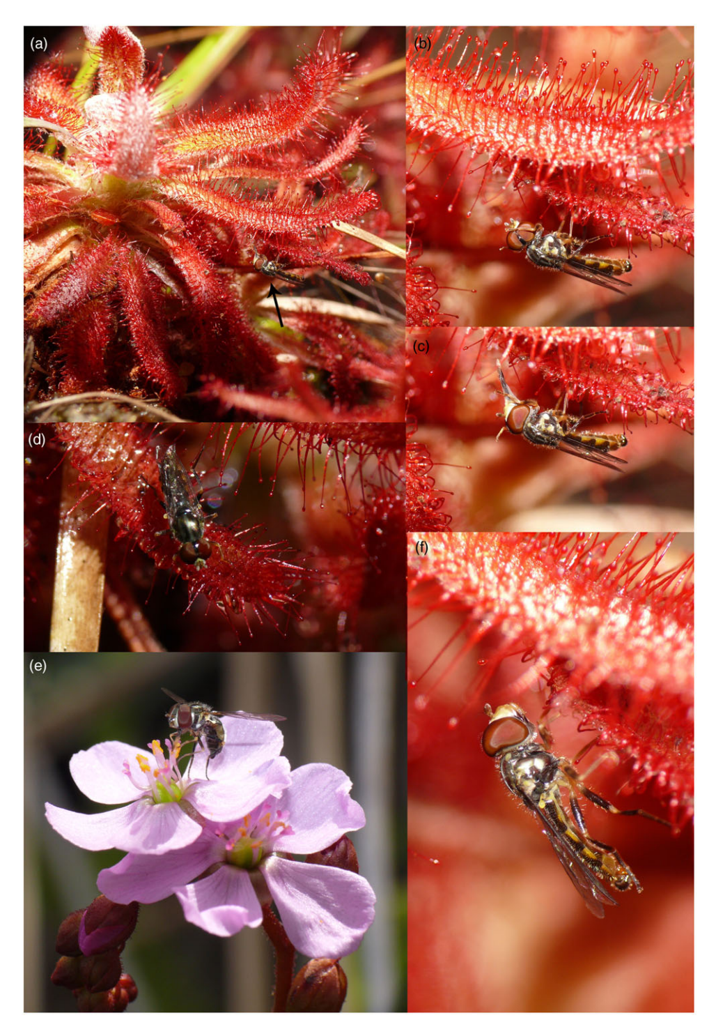
Figure 4. Biology of Toxomerus basalis adult flies associated with Drosera , documented in situ in Minas Gerais, Brazil. (a)–(d) + (f) Adult male sheltering beneath a leaf of Drosera graomogolensis during rain shower, Grão Mogol, Minas Gerais, 08 December 2018: (a)–(c) resting and showing cleaning behaviour, (d) leaving its carnivorous refuge by crawling over the sticky (yet rain-washed) leaves. (e) adult female feeding on pollen from a flower of Drosera latifolia , Rio das Lajas, 06 December 2018.