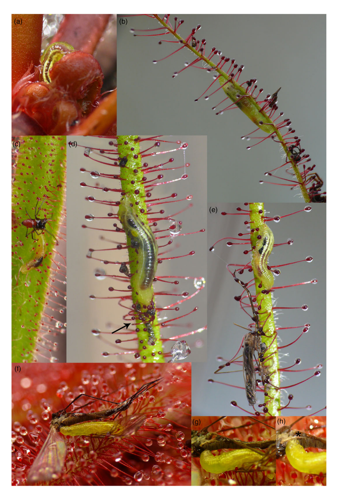
Figure 3. Biology and feeding habit of Toxomerus basalis larvae on Drosera leaves, documented in situ in Minas Gerais, Brazil (see also video material in the Electronic Appendix to this article). (a) L_3 larva hiding in the rosette centre of Drosera upon disturbance. (b) L_3 resting on the abaxial leaf tip. (c) L_2 larva approaching a captured, still-alive spider, not feeding on it as the prey is not yet fully immobilized. (d) L_3 feeding up a small, captured prey item, note where the tentacles have bent around the prey (arrow) but not commenced its digestion, as the tentacles heads have not yet darkened. (e) L_3 larva crawling to captured, immobilized nematoceran prey. (f)–(h) L_3 feeding on an immobilized but still living nematoceran that had been freshly placed on a leaf of Drosera graomogolensis (tentacles have not yet started bending over the prey), Botumirim, Rio do Peixe, Minas Gerais, 09 December 2018. * indicates anterior respiratory process visible during feeding. a on Drosera latifolia , Rio das Lajes, 06 December 2018. b, d, e on Drosera spiralis , Parque Nacional das Sempre Vivas, 06 December 2018. c on Drosera magnifica , summit of Pico do Padre Ângelo, 04 December 2018.