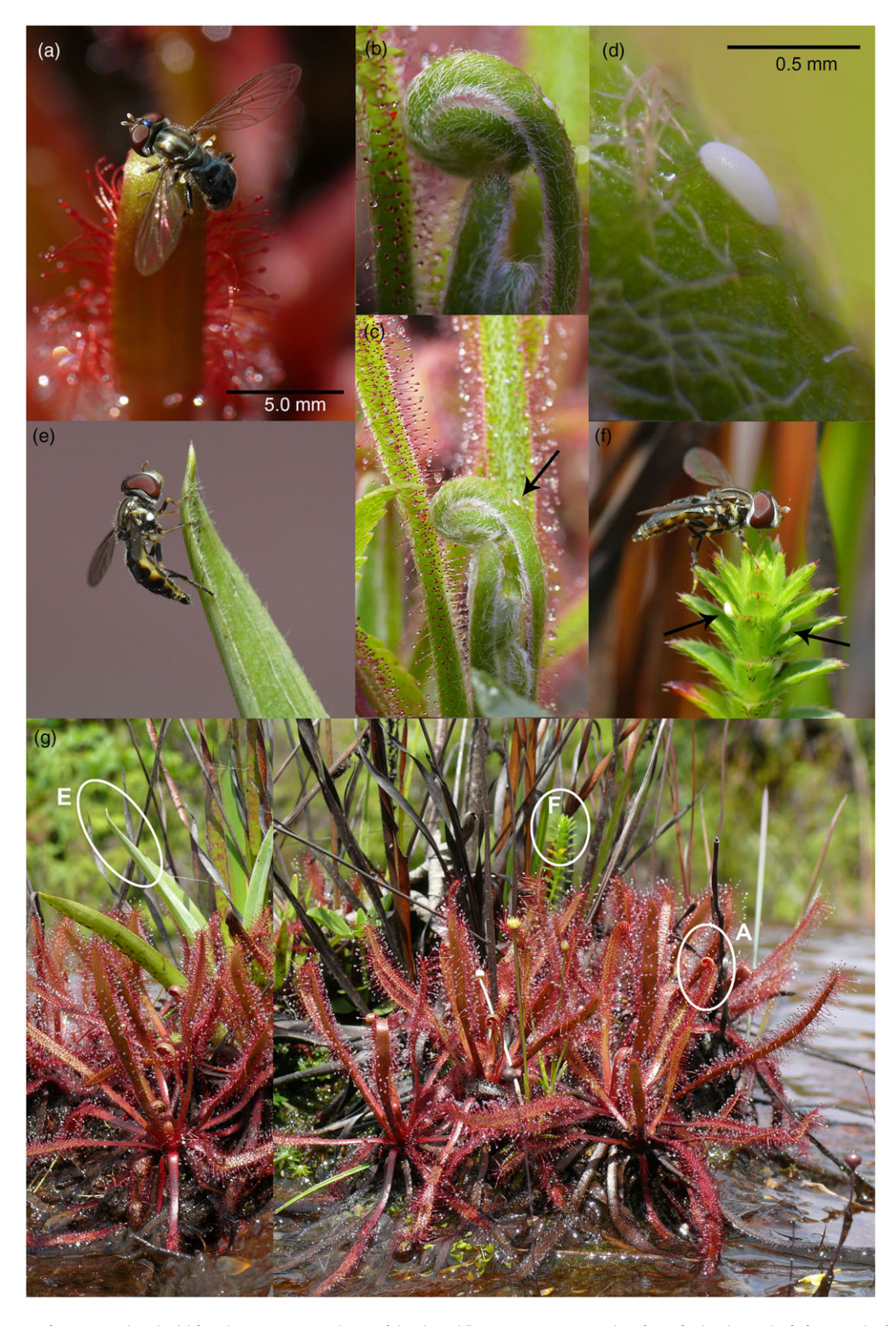
Figure 1. Oviposition of Toxomerus basalis . (a) female ovipositing on the tip of the abaxial (lower, non-carnivorous) surface of a developing leaf of Drosera latifolia . (b)–(d) Freshly deposited egg attached to the abaxial (lower) surface of an unfolding leaf of Drosera magnifica . (e)–(f) same female individual as pictured in (a) on plants growing in close proximity to Drosera . (e) Probing a leaf of Ericaulon sp. (Eriocaulaceae) – oviposition did not occur. (f) After oviposition on Microlicia sp. (Melastomataceae), with freshly laid egg visible (left arrow) – the same plant already held another Toxomerus egg (right arrow). (g) Overview of a colony of Drosera latifolia and associated plants, with oviposition sites documented under a, e, and f indicated. Image combined from two different photographs showing two different sides of that vegetation island that was patrolled by the Toxomerus basalis female. a, e–g: Diamantina, Distrito de São João da Chapada, Rio das Lajes, Minas Gerais, Brazil, 06 December 2018. b–d: summit of Pico do Padre Ângelo, Conselheiro Pena, Minas Gerais, Brazil, 04 December 2018.