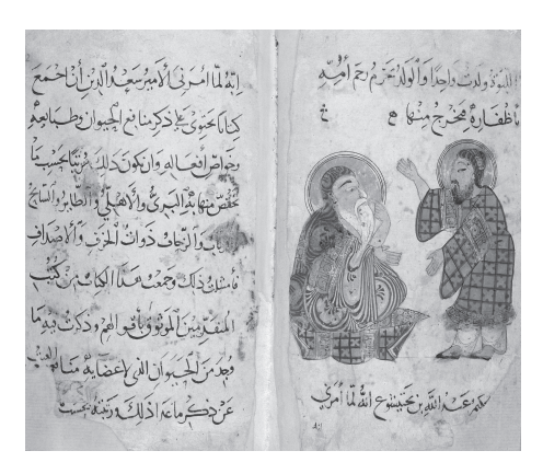
Figure VI.1.2 'Abdallāh ('Ubaydallāh?) ibn Bukhtīshū' (d. 396/1006), of the renowned family of Christian physicians, converses with Emir Sa'd al-Dīn. MS London, BL, Or. 2984, fols 101b-102a, 7th/13th century.

Rulers who surrounded themselves with physicians were not only the latter's patrons but also, of course, their patients (Figure VI.1.2). However, thanks to Genizah documents we have records of many ordinary patients. The role of women in these exchanges is particularly worthy of interest, since the patients mentioned are often female. Besides women who were patients, the Genizah also mentions female oculists (Goitein 1967, 127–8, 1971, 255). Doctor–patient interactions often had a cross-communal dimension. Genizah texts reveal that it was common for physicians from any community to treat patients from other communities, and this was true of Jewish doctors as of others, as we can see in the Genizah documents from the prescriptions in a variety of scripts, with different religious formulas, and varied names (Goitein 1971, 254; Chipman and Lev 2010, 78). For example, a Muslim doctor treated a Jewish girl with dropsy (Goitein 1967, 259); a Muslim family hired a Jewish doctor for a monthly fee (MS Cambridge, CUL, T-S 13J6.16; Goitein 1971, 256); payments were due to a Jewish physician for his daily visits to apparently Muslim patients (MS Cambridge, CUL, T-S Ar.4.10, in Judeo-Arabic); and a Christian doctor is said to have treated a Jewish patient for no fee (MS Cambridge, CUL,