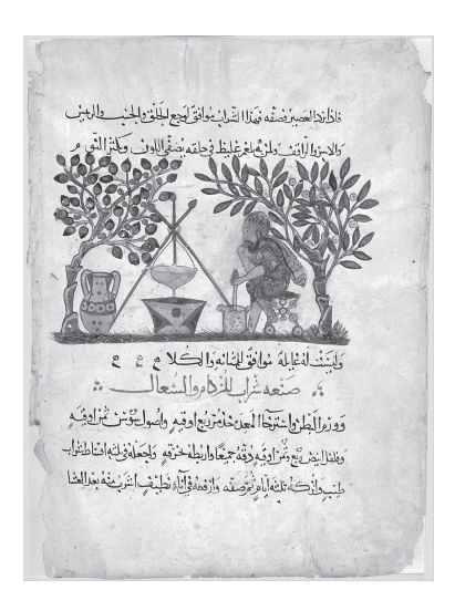
Figure VI.1.3 Illustration of the preparation of a cough elixir in an Arabic manuscript of Dioscorides's On Medicinal Substances. MS New York, The Metropolitan Museum of Art, acc. no. 13.152.6, Rogers Fund (1913); possibly from Iraq, dated 621/1224. This pharmacopeia (handbook of medicinal drugs) was exceptionally popular among scholars of all communities and was first translated into Arabic in the 3rd/9th century by (among others) the Christian scholars Iṣṭifān ibn Basīl (1st half 3rd/9th century) and Ḥunayn ibn Isḥāq (d. 260/873). A Genizah document records a Jewish physician working with a Christian one in a medical drug shop.

Physicians and apothecaries sometimes also physically shared workplaces with those of different confessions (Figure VI.1.3). A Genizah document records a court case in which an